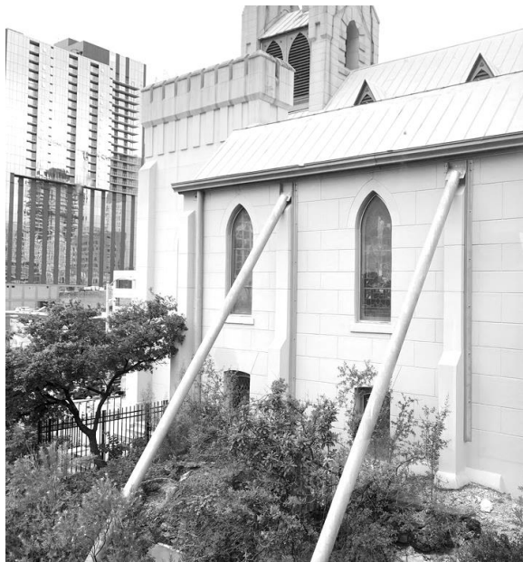
East side braces were installed in 2016 to help stabilize west wall. Eric Leibrock

In 2016, the church stabilized the west wall by installing nave crossties and large braces on the exterior east wall.