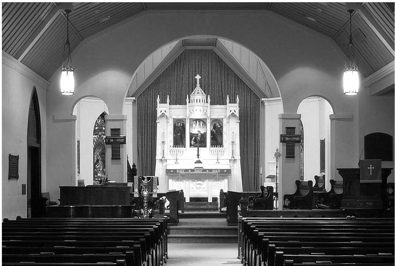
Top: In the late 1800s, decorative stenciling and murals adorned the chancel. Bottom: The marble reredos can be seen behind the altar, along with the thick, rounded arches of the chancel wall.