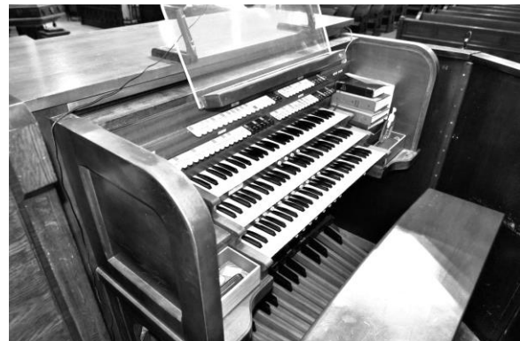
Top: Cracks developed on all interior and exterior stucco walls. Middle: The hardwood floor had various patches, mismatched wood, and termite damage. Bottom: The organ console was obsolete.

The Building Committee has been guided throughout the process by our architects, and general contractor, SpawGlass. The overall project cost of about $6.5 million has been covered by parishioner contributions to the “It’s Our Turn” capital campaign and extension, by contributions from the Next-to-New Shop, and by two major grants from the Castleberry Fund for Historic Preservation. As a part of St. David’s 175th anniversary celebration, handcrafted items made from the old Historic Church floor will be available for purchase.