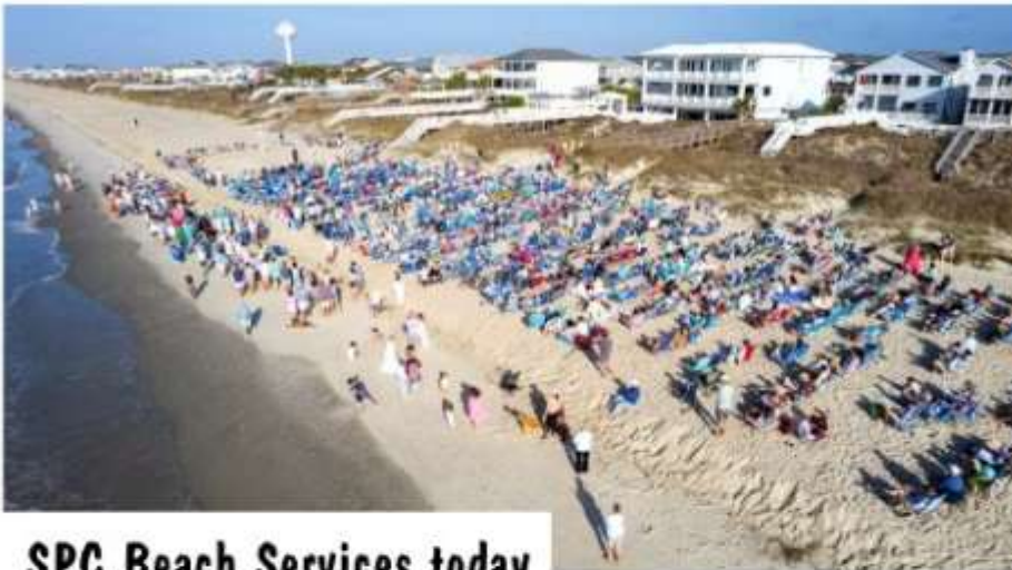
SPC Beach Services today