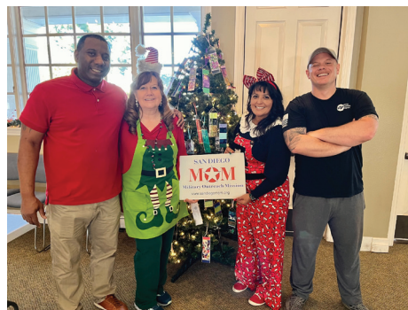
Military Outreach Ministries (MOMS)