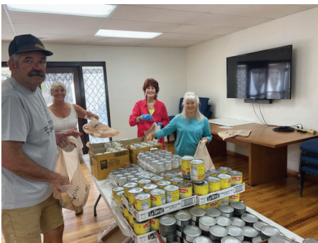
Loaves & Fishes