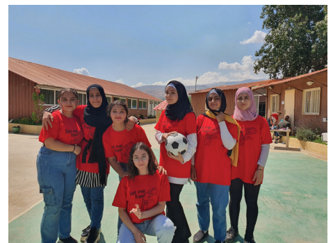
Together for the Family, Lebanon