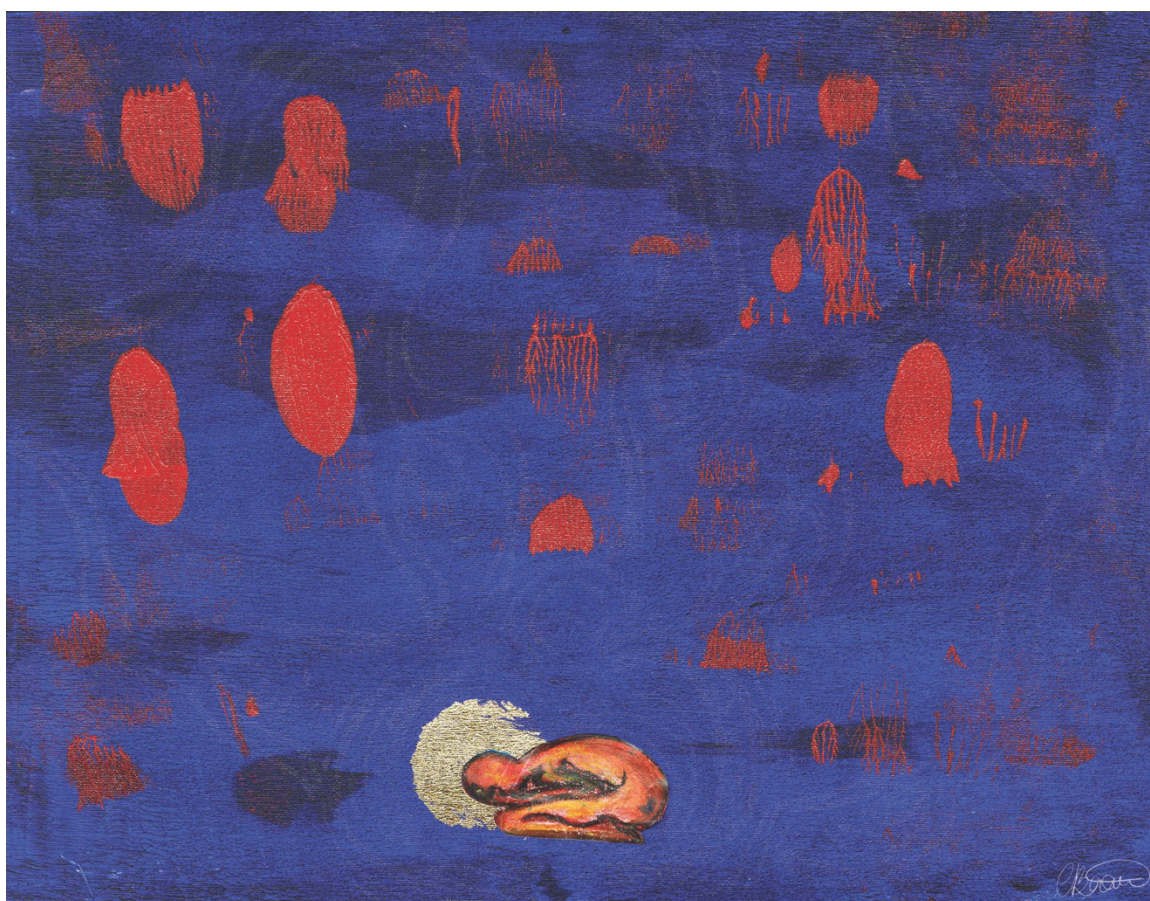
Depths by Carmelle Beaugelin Caldwell

4602 Cary Street Road Richmond, VA 23226 fprichmond.org | (804) 358-2383