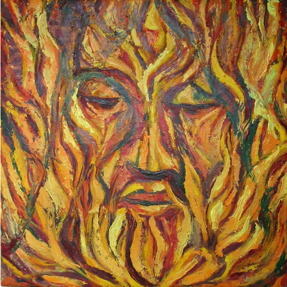
Jesus the Fiery Prophet by Jyoti Sahi

4602 Cary Street Road Richmond, VA 23226 fprichmond.org | (804) 358-2383