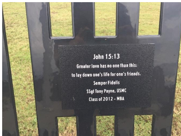
EXAMPLE BENCH PLAQUE (front)