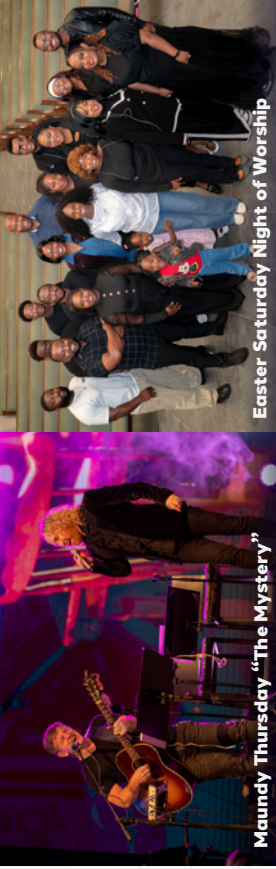
Maundy Thursday "The Mystery"