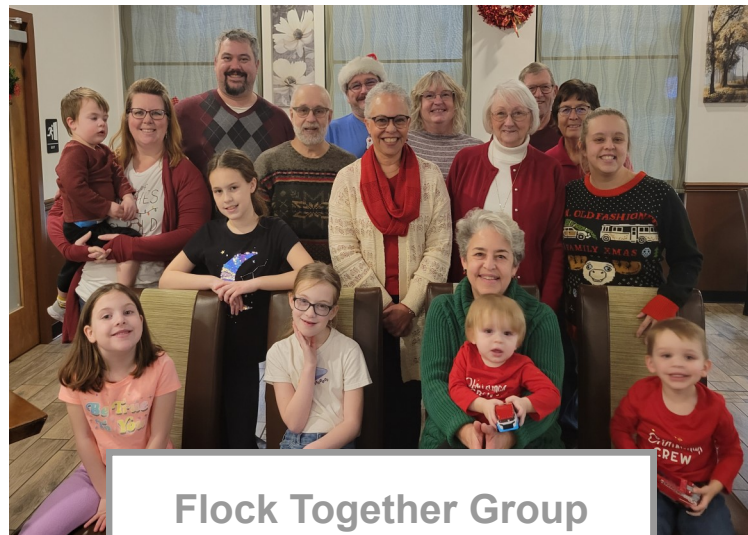
Flock Together Group at Hoss's

Collection Dates: Now through February 12, 2023