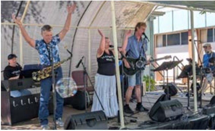
The praise - and the temperature - kept rising as our very own AMPT Praise Team participated in the 18th Annual SummerFest gathering Sunday, August 10th.