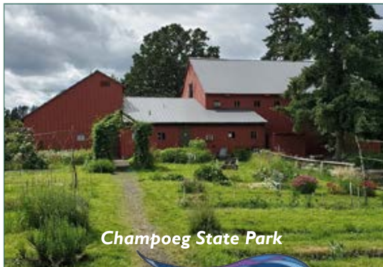
Champoeg State Park

Find this and other live-streamed Assembly events HERE .