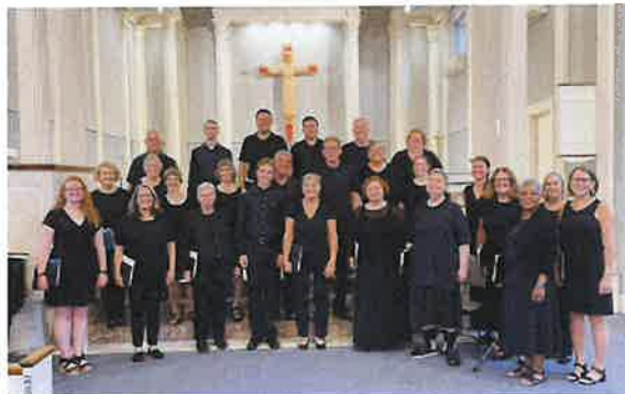
Pictures in the left column, from top to bottom: VBS, VBS, FPC puppeteers, choir tour, Summer 2024