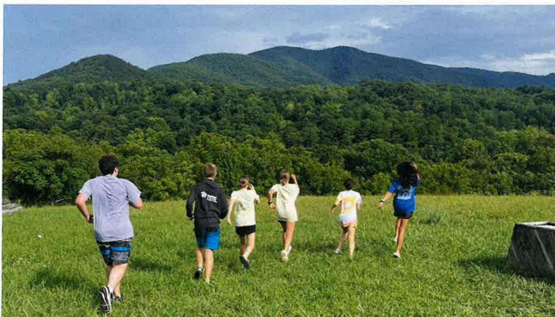
The Habitat Youth, exploring the beauty of Virginia

THE NEWSLETTER OF FIRST PRESBYTERIAN CHURCH OF METUCHEN, NJ