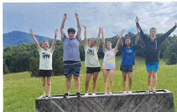
Pictures in the right column, Habitat Youth, Community Garden, church picnic, Indonesian Fellowship Youth beach trip, Summer 2024