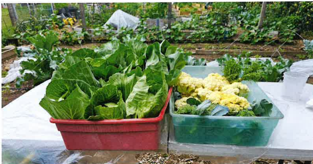
Produce from the Food Pantry Garden that helps feed the food pantry clients

As the pantry supporters above have stated, assisting individuals in need is truly a beautiful thing!