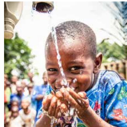
Living Water International

ICM's vision is a healthy church within walking distance of everyone in the world. ICM partners with indigenous ministries to equip churches with a permanent building and discipleship resources in their native language. The church building serves as a place of worship as well as an outreach center for the community, serving both physical and spiritual needs. Local church leaders are trained to plant churches in nearby unreached communities, reaching places that outsiders could never access.