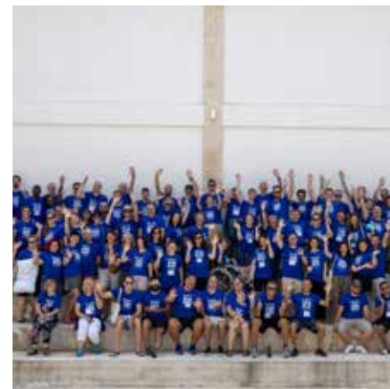
Renewing Our Minds

Renewing Our Minds seeks to reconcile people of different faiths and cultures in the Balkan region by studying the teachings of Jesus. Participants are chosen based on leadership potential, with the hope they will return to their home countries and impact their spheres of influence.