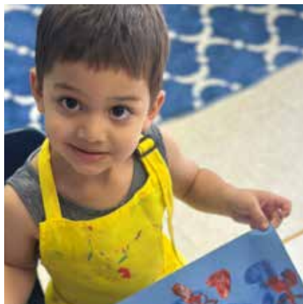
Nabor House Community

Nabor House Community invests in the growth and development of children from low-income families by providing quality, affordable early childhood centers in a Christian environment, enabling parents to pursue employment or education.