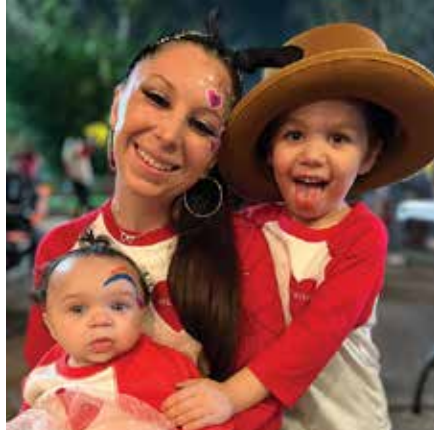
Santa Maria Hostel

Santa Maria Hostel is one of Texas' largest multi-site residential and outpatient substance use disorder treatment centers for women, and one of a very few to offer a full continuum of services for women who are pregnant or parenting. By providing a safe, home environment, they allow mothers to stay with their young children while receiving care and treatment. Santa Maria Hostel partners with more than 130 community based organizations to provide a full spectrum of care and support to women in recovery.