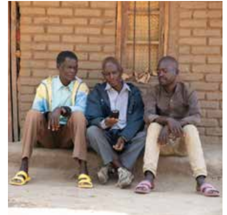
Far East Broadcasting Company

Far East Broadcasting Company (FEBC) seeks to make Jesus known among the world's least reached people by sharing the Good News through various media. FEBC broadcasts in 152 languages in 50 countries. For over 80 years, FEBC has been focusing on meeting the spiritual needs of their listeners and inspiring them to follow Jesus Christ.