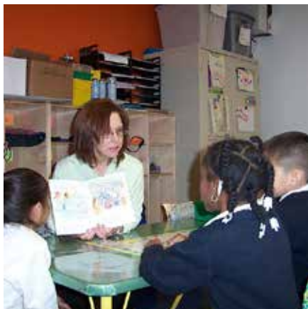
Houston Achievement Place

In collaboration with a network of more than 1,600 community partners including pantries, schools, and multi-service centers the HFB helps thousands of individuals each week through innovative programming and services. As one of MDPC's strategic partners, the HFB supports many MDPC supported pantry programs, including the Fuente Food Pantry, as well as SBISD's Backpack Buddy Program, and the Food for Change program that produced the Eagle Pantry at Houston Community College's Spring Branch campus.