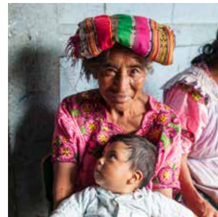
Faith in Practice

Founded by MDPC members in 1994, Faith In Practice works to improve the physical and spiritual health of people living in poverty in Guatemala through short-term surgical, medical, and dental mission trips and health-related education programs. Volunteer doctors, nurses, and dentists demonstrate God's love and compassion as they serve alongside local volunteers to provide healthcare to more than 24,000 Guatemalans annually.