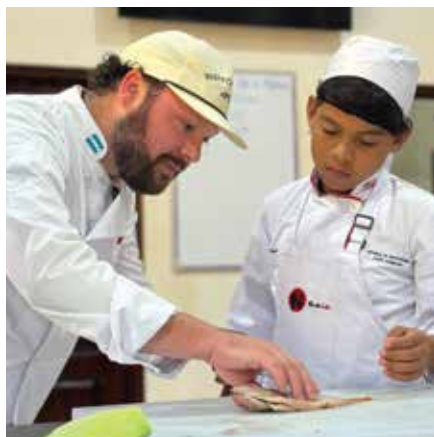
The Micah Project

The Micah Project ministers to young men and boys who have spent anguished childhoods in impoverished homes or on the streets of Tegucigalpa. The "Micah boys" are provided a loving home and learn to become Christian leaders through discipleship, education, and service to others. The Micah Project supports these young men as they learn to "act justly, love mercy, and walk humbly with our God." -Micah 6:8