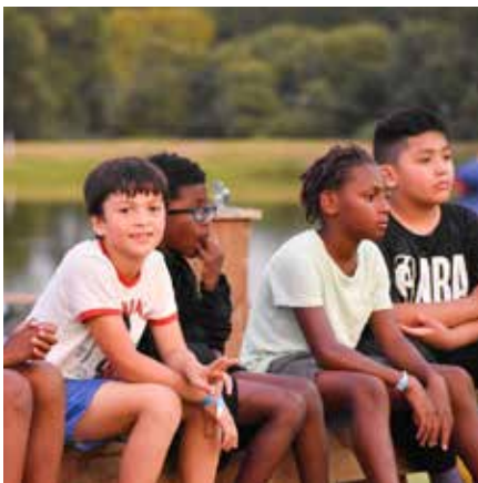
Stoney Creek Ranch

Stoney Creek Ranch is a Christian Camp, located in New Ulm, dedicated to serving urban youth. They serve young people in ways that will allow them to come to know Christ, His role in their lives and to develop an authentic personal relationship with Him. They work with organizations that target urban youth, who rarely experience the beauty of God's creation through a life-changing camping adventure in the great outdoors.