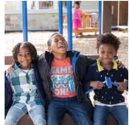
Small Steps Nurturing Center