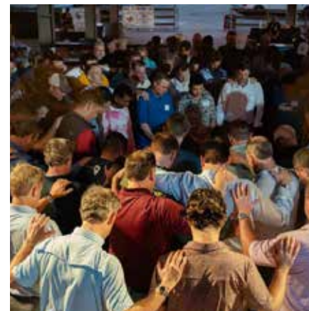
Fellowship in Discipleship (FIND)

This ministry partner mobilizes Egyptian missionaries and churches to share the Gospel with unreached people in Egypt and throughout the Arabic-speaking world. They serve in 15 countries across the Middle East and North Africa through outreach, discipleship, church planting, and leadership development. For security reasons, the organization's name cannot be published.