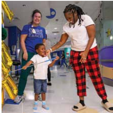
His Grace Foundation

Faith Ministry aims to meet the basic physical needs of families living in poverty on the Mexican border, and in doing so, it shares the love of Jesus Christ. Through home construction, a medical clinic, food programs, child sponsorship, and skills training programs, it cares for the community and makes Christ's Name known.