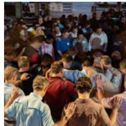
Fellowship in Discipleship (FIND)

This ministry partner mobilizes Egyptian missionaries and churches to share the Gospel with unreached people in Egypt and throughout the Arabic-speaking world. They serve in 15 countries across the Middle East and North Africa through outreach, discipleship, church planting, and leadership development. For security reasons, the organization's name cannot be published.