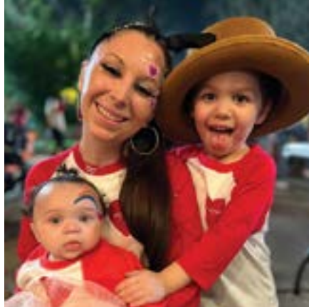
Santa Maria Hostel

Santa Maria Hostel is one of Texas' largest multi-site residential and outpatient substance use disorder treatment centers for women, and one of a very few to offer a full continuum of services for women who are pregnant or parenting. By providing a safe, home environment, they allow mothers to stay with their young children while receiving care and treatment. Santa Maria Hostel partners with more than 130 community based organizations to provide a full spectrum of care and support to women in recovery.