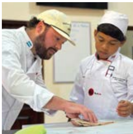
The Micah Project

The Micah Project ministers to young men and boys who have spent anguished childhoods in impoverished homes or on the streets of Tegucigalpa. The "Micah boys" are provided a loving home and learn to become Christian leaders through discipleship, education, and service to others. The Micah Project supports these young men as they learn to "act justly, love mercy, and walk humbly with our God." -Micah 6:8