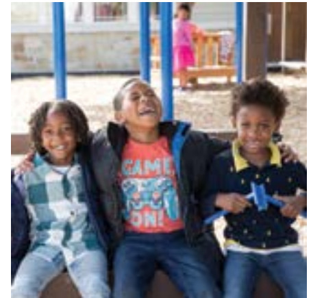
Small Steps Nurturing Center