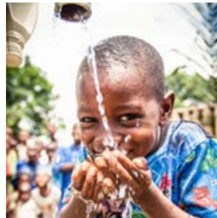
Living Water International

Living Water International exists to demonstrate the love of God by helping communities acquire desperately needed clean water, and experience "living water"—the gospel of Jesus Christ—which alone satisfies the deepest thirst. Mission teams work in impoverished communities to provide a water well and hygiene education, and to share the love of Christ.