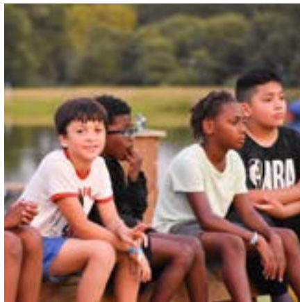
Stoney Creek Ranch

Stoney Creek Ranch is a Christian Camp, located in New Ulm, dedicated to serving urban youth. They serve young people in ways that will allow them to come to know Christ, His role in their lives and to develop an authentic personal relationship with Him. They work with organizations that target urban youth, who rarely experience the beauty of God's creation through a life-changing camping adventure in the great outdoors.