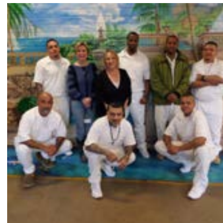
Bridges to Life