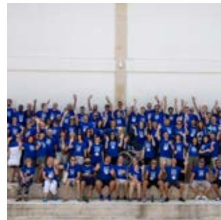
Renewing Our Minds

Renewing Our Minds seeks to reconcile people of different faiths and cultures in the Balkan region by studying the teachings of Jesus. Participants are chosen based on leadership potential, with the hope they will return to their home countries and impact their spheres of influence.