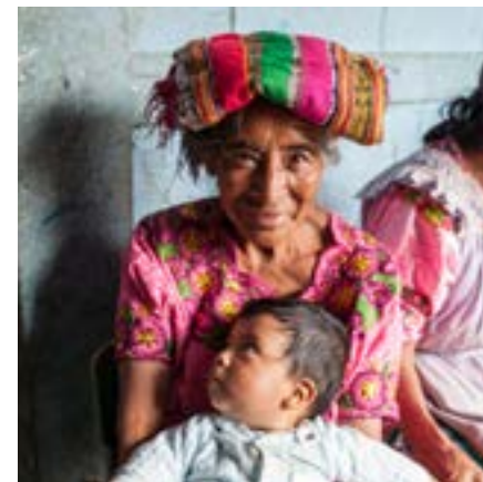
Faith in Practice

Founded by MDPC members in 1994, Faith In Practice works to improve the physical and spiritual health of people living in poverty in Guatemala through short-term surgical, medical, and dental mission trips and health-related education programs. Volunteer doctors, nurses, and dentists demonstrate God's love and compassion as they serve alongside local volunteers to provide healthcare to more than 24,000 Guatemalans annually.