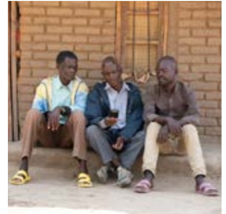
Far East Broadcasting Company

Far East Broadcasting Company (FEBC) seeks to make Jesus known among the world's least reached people by sharing the Good News through various media. FEBC broadcasts in 152 languages in 50 countries. For over 80 years, FEBC has been focusing on meeting the spiritual needs of their listeners and inspiring them to follow Jesus Christ.