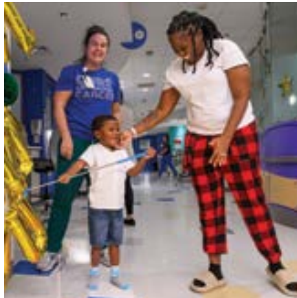
His Grace Foundation

Faith Ministry aims to meet the basic physical needs of families living in poverty on the Mexican border, and in doing so, it shares the love of Jesus Christ. Through home construction, a medical clinic, food programs, child sponsorship, and skills training programs, it cares for the community and makes Christ's Name known.