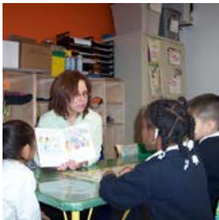
Houston Achievement Place

In collaboration with a network of more than 1,600 community partners including pantries, schools, and multi-service centers the HFB helps thousands of individuals each week through innovative programming and services. As one of MDPC's strategic partners, the HFB supports many MDPC supported pantry programs, including the Fuente Food Pantry, as well as SBISD's Backpack Buddy Program, and the Food for Change program that produced the Eagle Pantry at Houston Community College's Spring Branch campus.