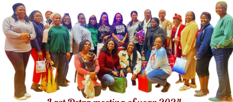
Last Petra meeting of year 2024