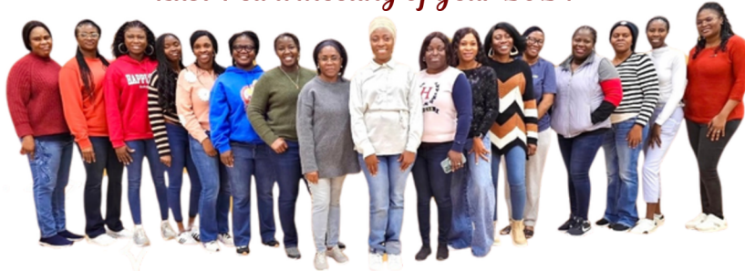
First Petra meeting of year 2025