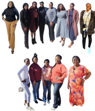
January facilitators: Ruby Group