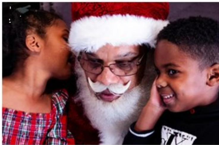
Spreading Christmas Cheer!

Northside Neighborhood House thanks you for your generous donations of canned and dry goods during the time SNAP benefits were discontinued. We will continue to collect, but will change distribution to Rivermont Elementary School. The school is preparing food boxes for school families for Christmas.