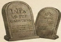
Exodus 20:8-11 REMEMBER THE SABBATH DAY