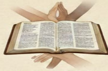
Romans 14:4-6 ONE PERSON ESTEMES ONE DAY AS BETTER