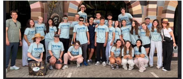
Kirk in the Hills Youth Group Serving In Costa Rica June 19, 2026