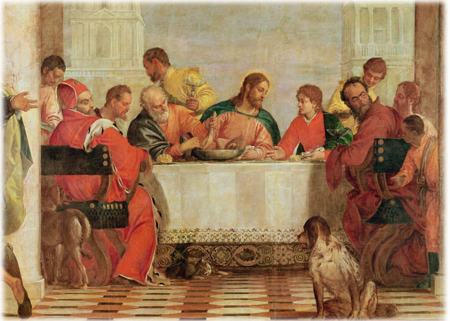
Detail (section) The Feast in the House of Levi | Paolo Veronese, 1573 | public domain