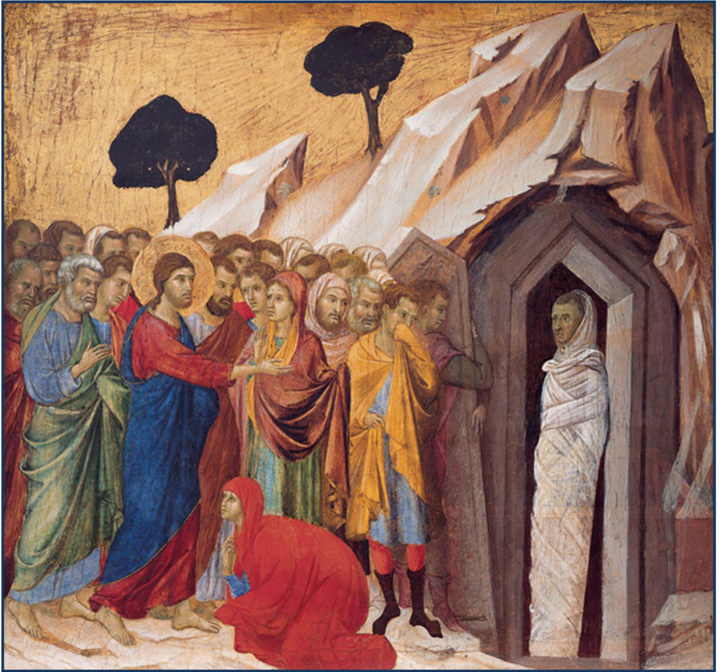
Raising of Lazarus | Duccio, di Buoninsegna | from Art in the Christian Tradition , a project of the Vanderbilt Divinity Library