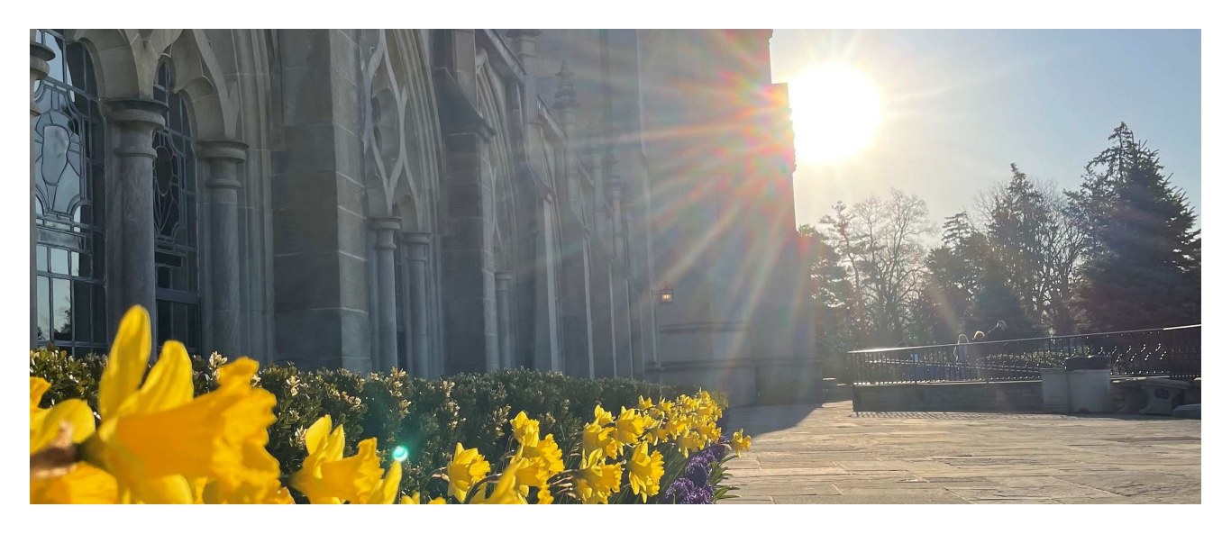
We envision a world where every heart experiences God's transforming love.