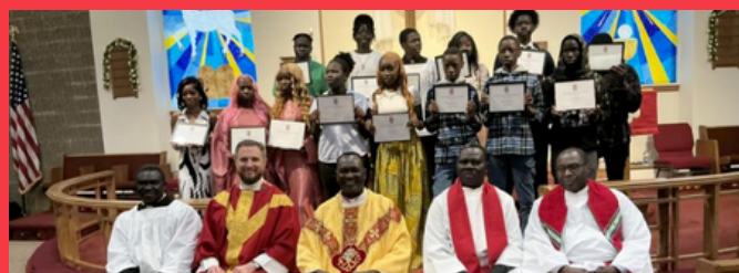
Sudanese Congregation at St. Bartholomew's – Buffalo, NY