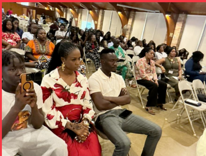
Attendees at the Sudanese Family Conference