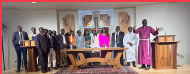
Kush Anglican – Harrisonburg, VA