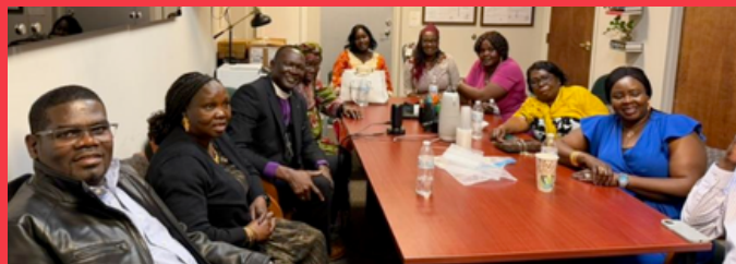
Church of the Redeemer – Greensboro, NC