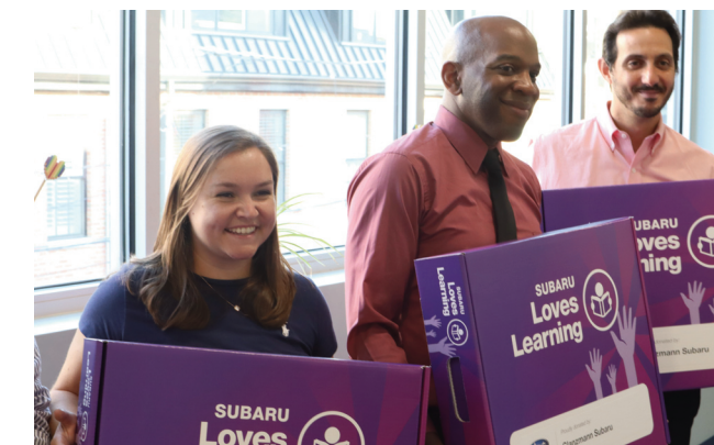
Teachers loved the surprise Educational Kits!

On Thursday, September 15th, Glanzmann Subaru, alongside Subaru of America, and the Adopt a Classroom program came to La Salle Academy to surprise our students and staff during an assembly. The Subaru Loves Learning program was able to provide our teachers with a donation of $10,000 to split among our six classrooms and our Art, Technology and Music teachers. The Glanzmann Subaru donation will go a long way in helping to create the best educational space possible.