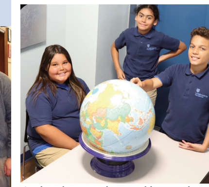
Students learning about world geography.