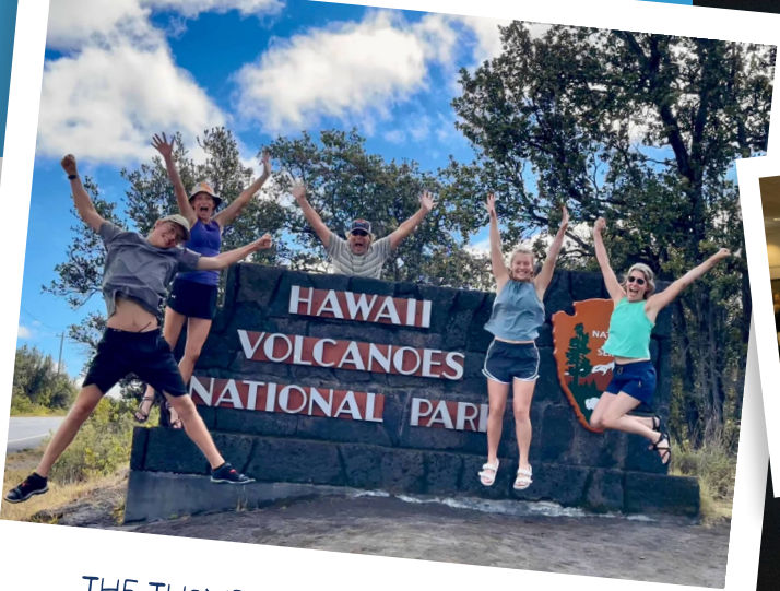
THE THOMPSON FAMILY VISITING THEIR 63 RD AND FINAL NATIONAL PARK!