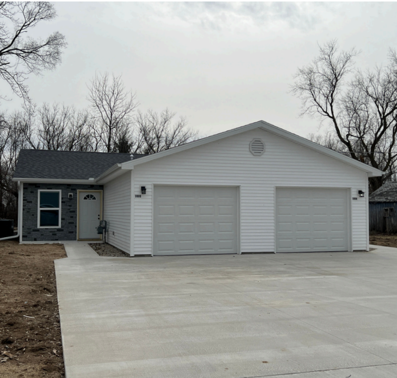
Duplex units in the Village of Rosebush, Isabella County, that received funding from the MSHDA MI Neighborhood program in 2025.

In response, Middle Michigan Development Corporation has made workforce support a core pillar of our economic development strategy, with a growing focus on housing and childcare solutions that reflect the realities of Michigan communities.