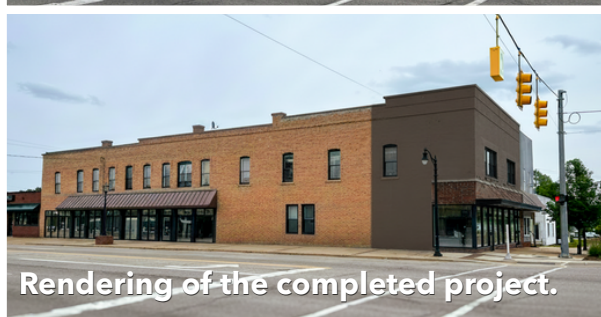
Rendering of the completed project.