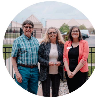
Bill's Custom Fab