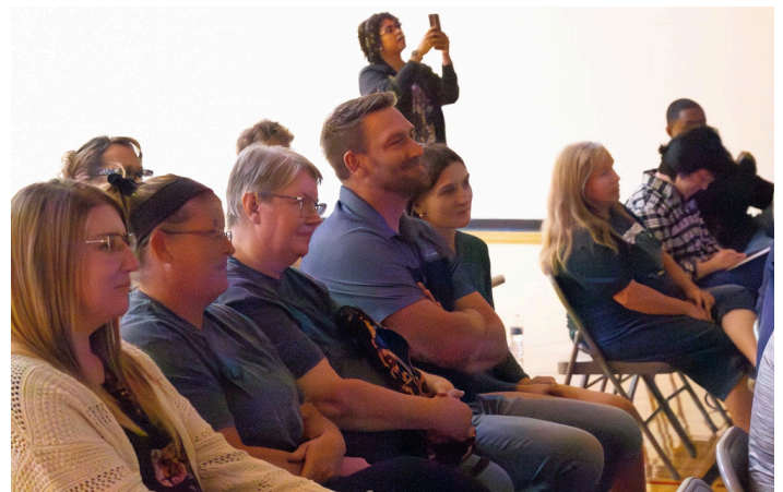
Attendees at Downtown Pitch