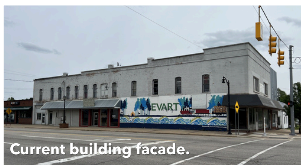
Current building facade.