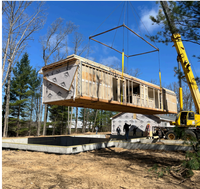
Duplex units in the City of Harrison, Clare County, that received funding from the MSHDA MI Neighborhood program are set on their foundation.

Access to safe, affordable housing has become one of the most significant barriers to workforce participation across our region. Through partnerships with local governments, developers, employers, and state agencies, MMDC has helped advance housing conversations that are grounded in workforce needs – from entry-level workers and young professionals to families and seniors looking to age in place.