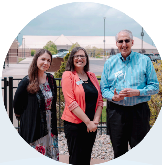
Greater Gratiot Development, Inc.