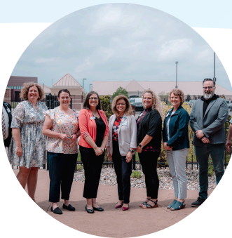
MyMichigan Health Clare Campus