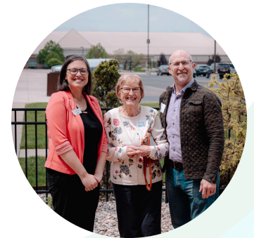
M & J Market