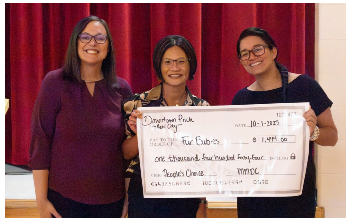
Lake Osceola State Bank presenting People's Choice check.