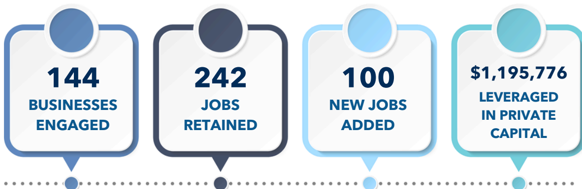
SINCE THE LAUNCH OF THE TRUSTED CONNECTOR PROGRAM IN 2025.

Together, these efforts significantly broadened MMDC’s visibility and impact across the region. The Trusted Connector Program allowed us to move beyond transactional support and deepen our role as a relationship-driven partner in economic development – one conversation, one connection, and one business at a time.