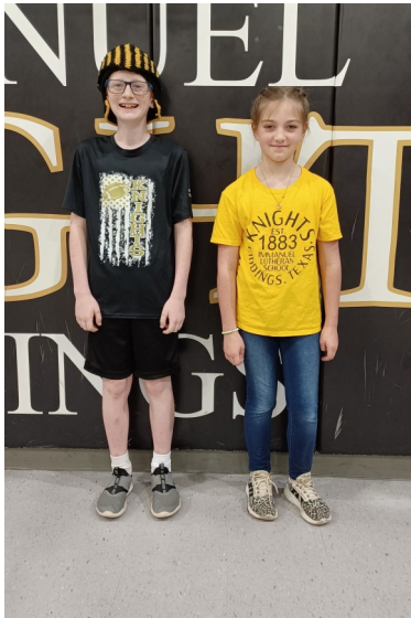
Knight Awardees for Self-control 3-10

The Gala is a fun evening of food, fellowship, and fund-raising for our school. A delicious steak dinner is followed by robust bidding for great auction items. The evening concludes with spirited dancing with music provided by Texas Unlimited Band. All proceeds go toward curricular items, tech, and general support of the school. We would love to have every family attend. See the attached flyer for pricing details.