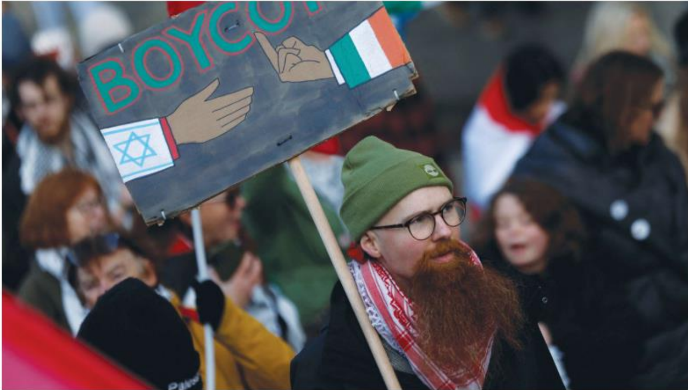
A demonstrator holds a placard in support of Palestinians during a march on the International Day of Solidarity, in Dublin last year.