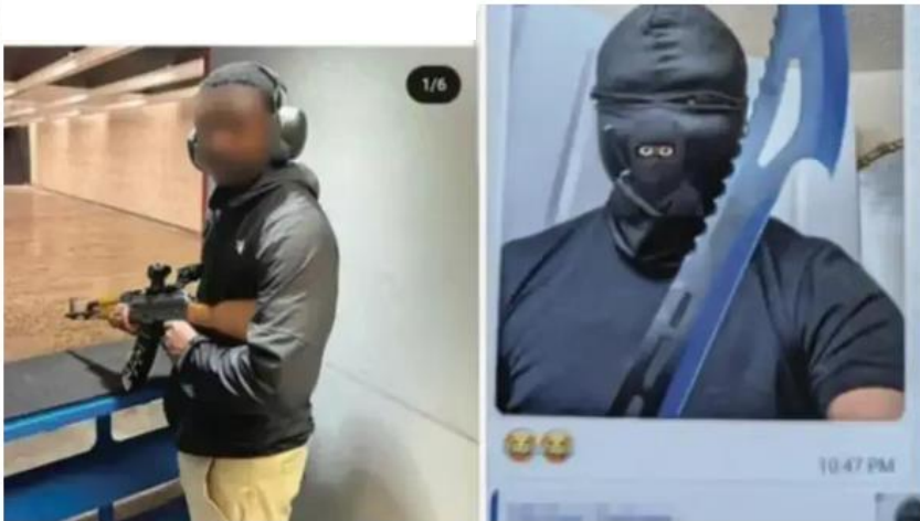
Some of the messages sent by Teekaye

Israel National News / Jan 31, 2026, 8:15 PM (GMT+2) FBI ISIS Maryland DOI