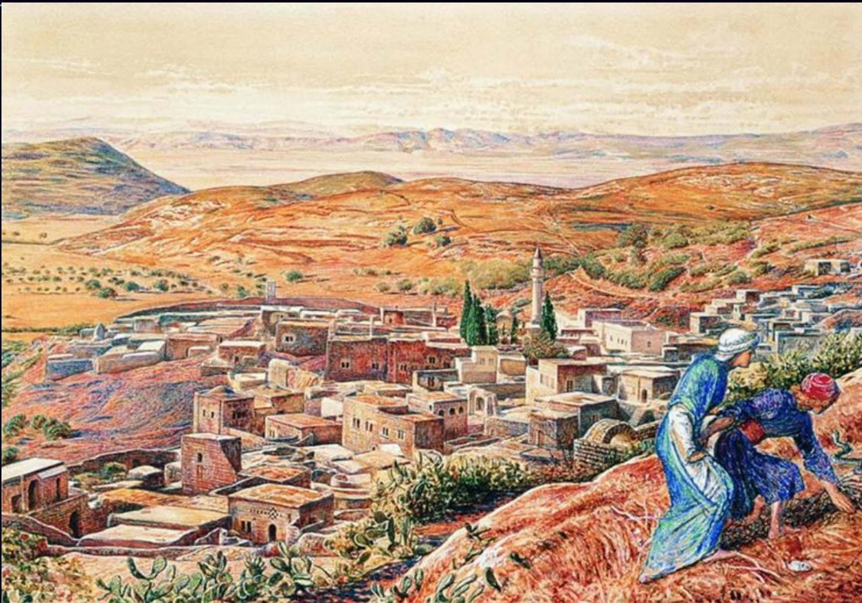
Painting of ancient Nazareth