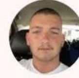
Bar Kupershtein 23