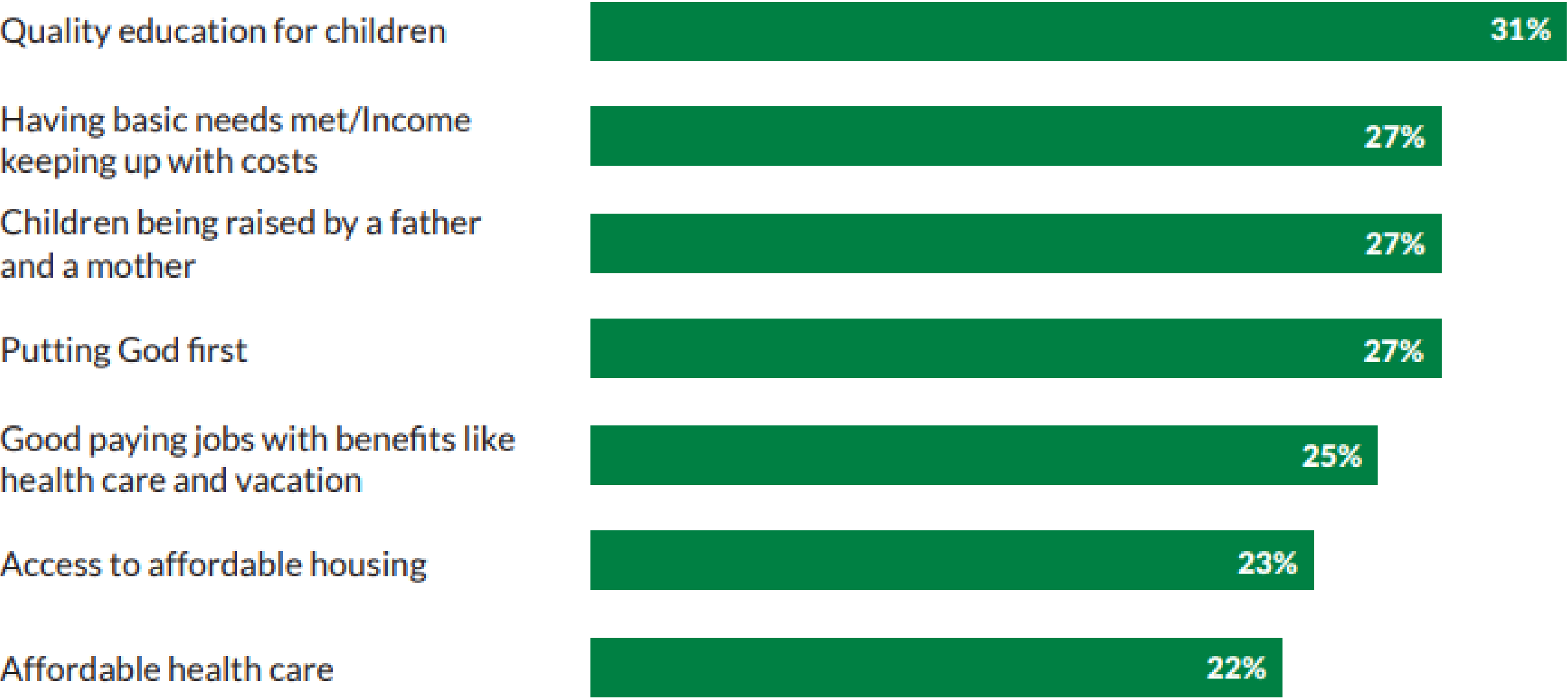
FIGURE 14. Percent of parents who say the following makes families strong: