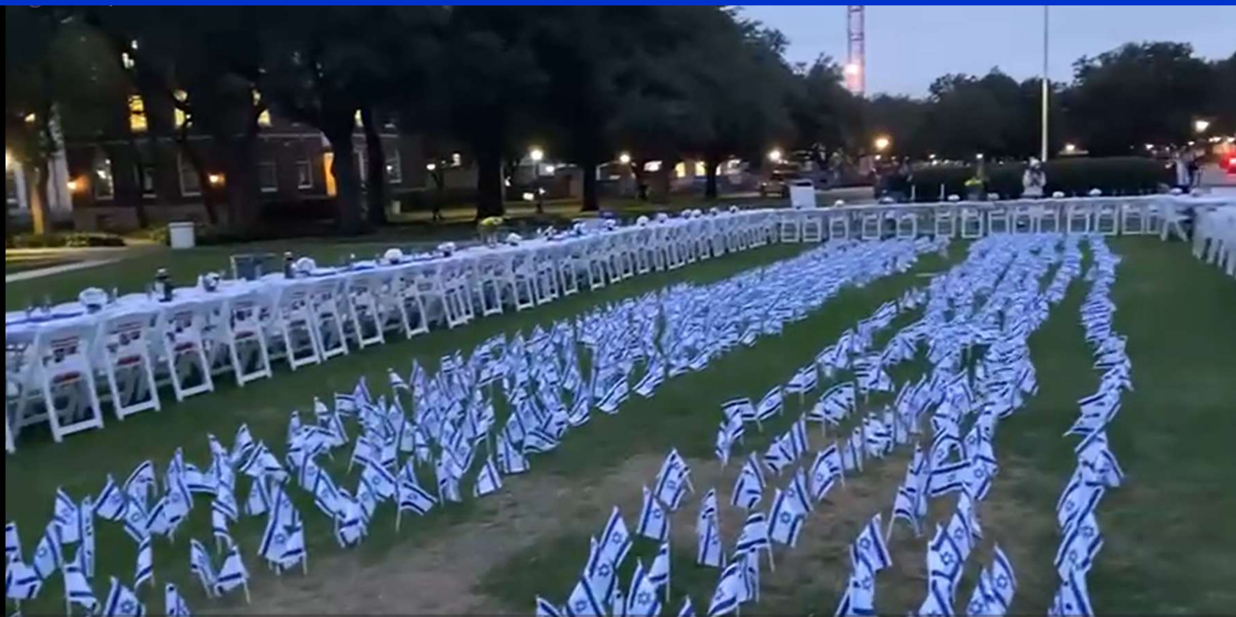
According to the Jewish Federation of Greater Dallas - 239 chairs were set up at SMU to represent an empty Shabbat table of the Israeli hostages that are currently being held by Hamas. In addition, 1,400 Israeli flags were set up around the tables to represent those who died in Israel on October 7, 2023.