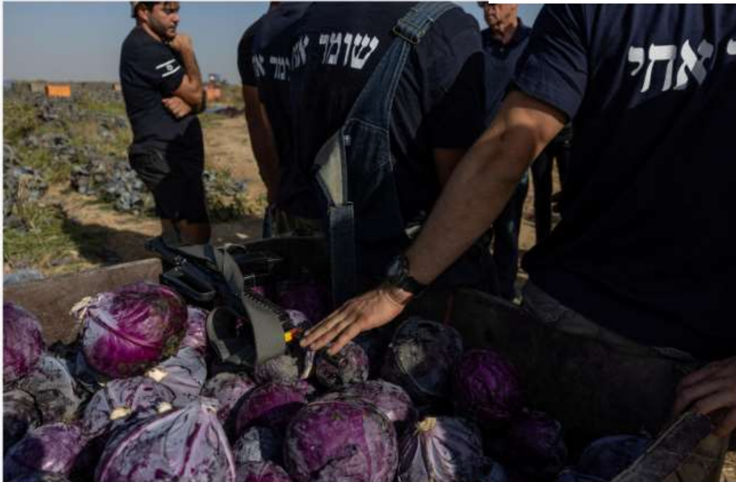
Volunteers who have come to harvest cabbages, work on Israeli farms near the Gaza border since production stopped after the Hamas attack October 7th attack, in Patish, Israel November 8, 2023

https://www.jpost.com/israel-news/article-773563