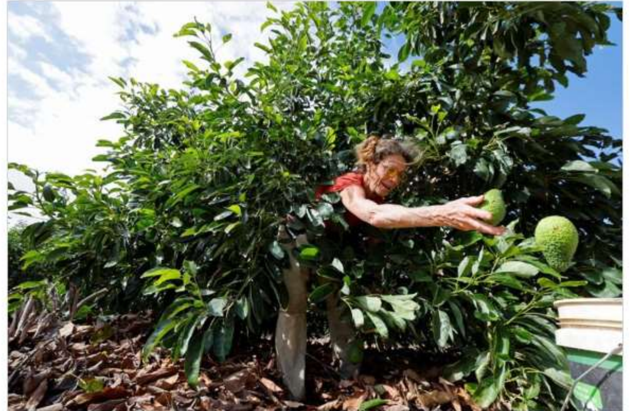
An Israeli volunteer helps farmers from Kibbutz Beeri, Israel, to pick Avocados from their land as part of an initiative to help farmers from Kibbutzes in Israel near the border with Gaza to pick the crops after the October 7 deadly attack by Hamas gunmen from Gaza in the Kibbutzes around, November 15, 2023

By Reuters | Nov. 16, 2023, at 9:27 a.m.