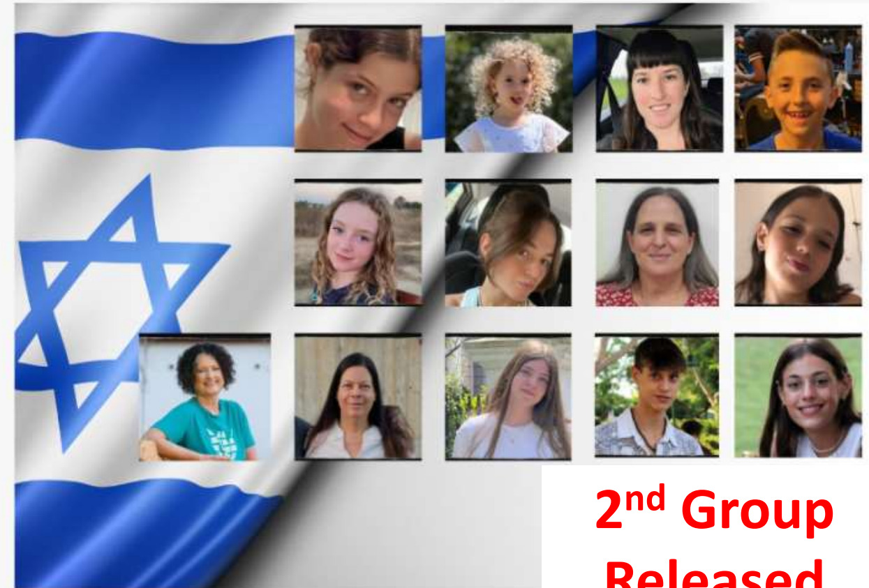
The thirteen hostages released from Gaza on Saturday, November 25, 2023