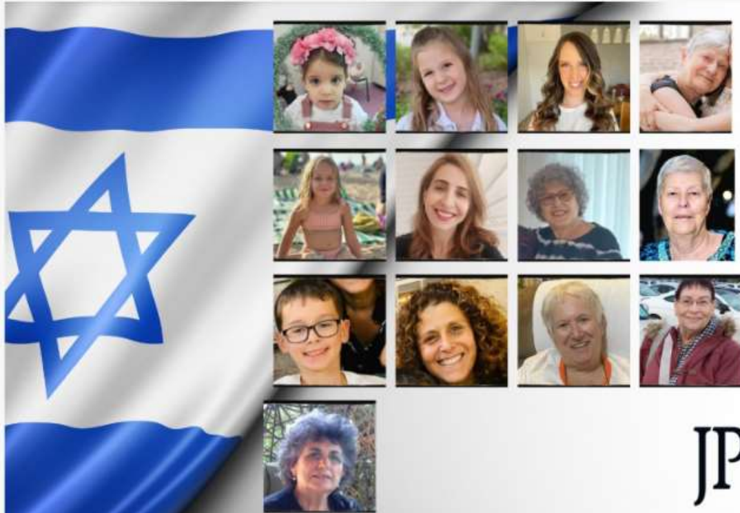
The thirteen hostages released from Gaza on Friday, November 24, 2023.