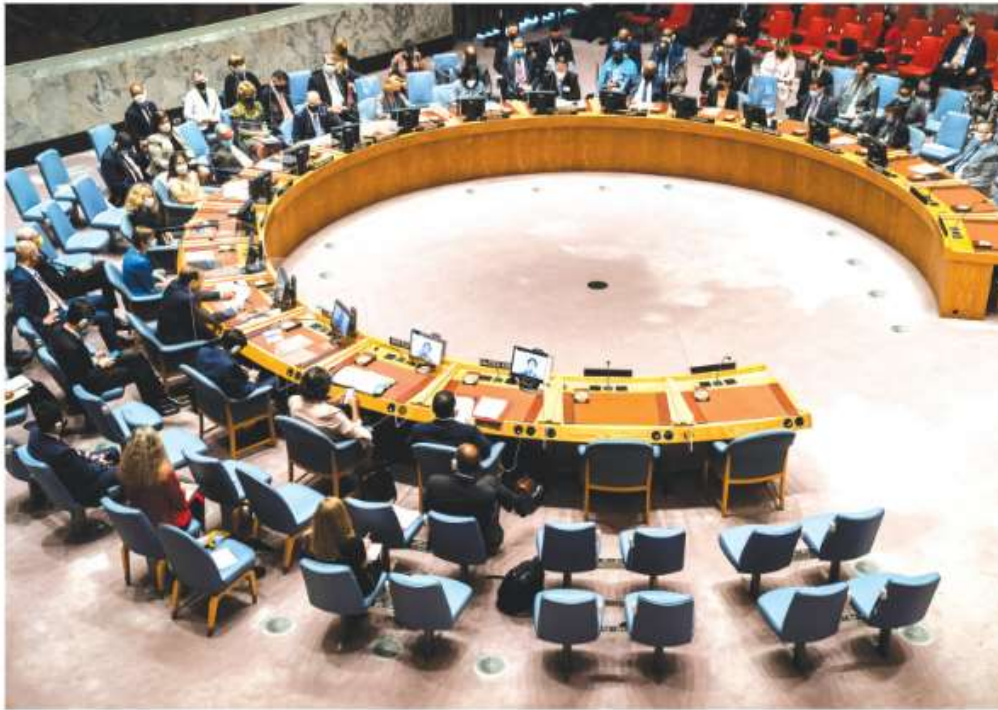
A MEETING of the UN Security Council earlier this year.