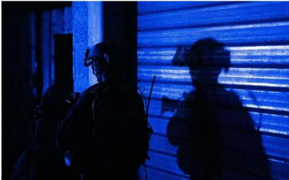
IDF soldiers operate at Shifa Hospital in Gaza City overnight in a handout photo distributed on November 15, 2023.