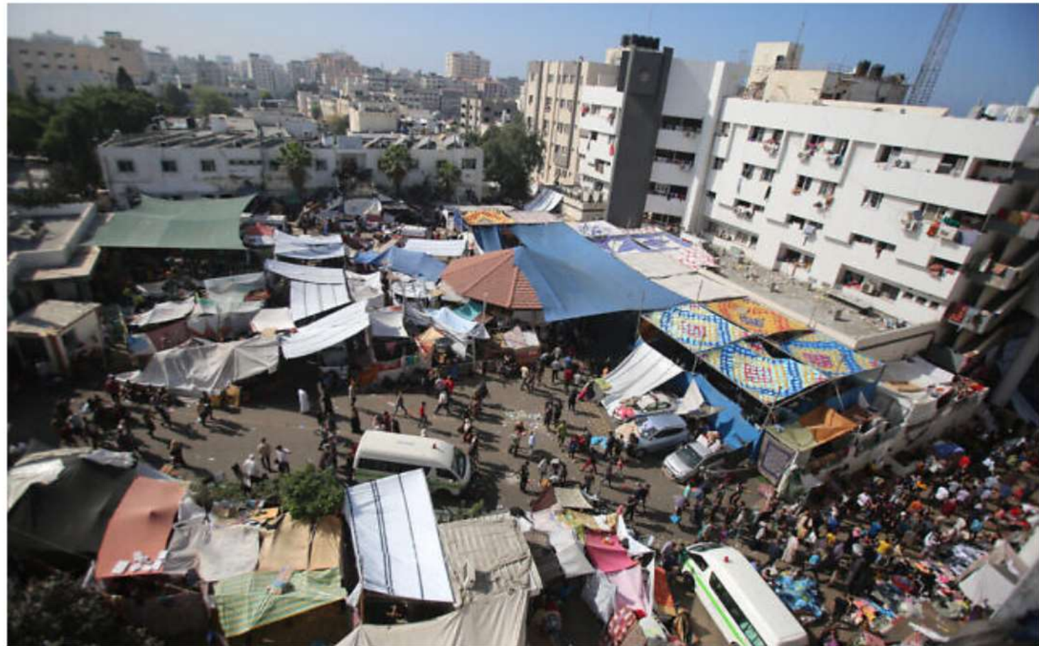
File: An aerial view shows the compound of Shifa Hospital in Gaza City on November 7, 2023.