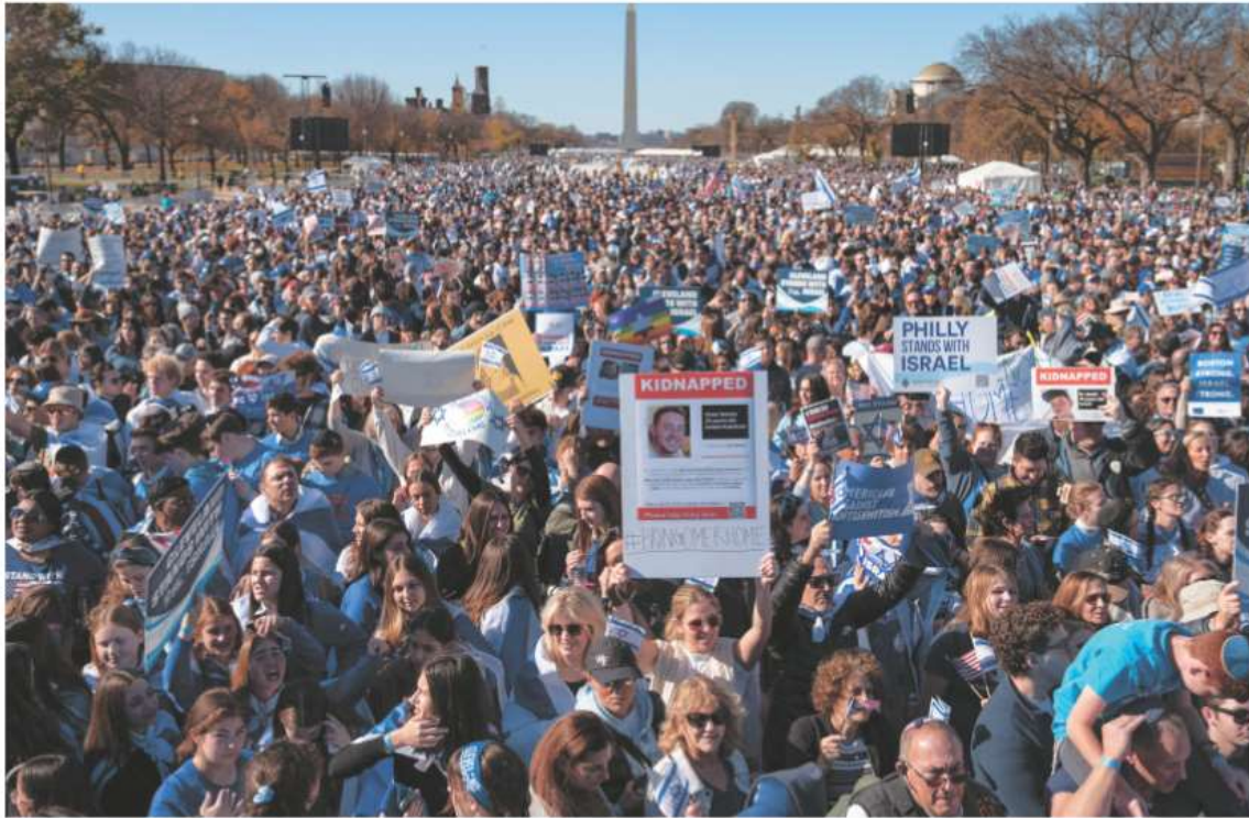
Thousands attend the March for Israel, National Mall, Washington DC, November 14, 2023