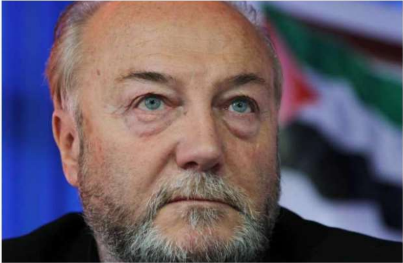
George Galloway

https://www.jpost.com/arab-israeli-conflict/gaza-news/article-772775?utm_source=jpost.app.apple&utm_medium=share