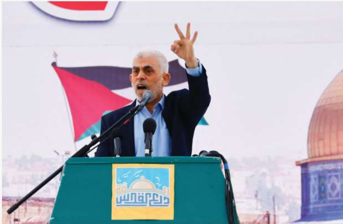
HAMAS GAZA leader Yahya Sinwar speaks at a rally marking Quds Day (Jerusalem Day), in Gaza, in April.

Hamas is "ready to conduct" an immediate release of all Israeli hostages in the Gaza Strip in exchange for all Palestinian security prisoners in Israeli prisons, the terror group said in a statement attributed to Yahya Sinwar. The IDF spokesperson, who was giving a daily briefing at the time of the statement, responded by suggesting that the timing of the statement was "psychological terror." "We will continue to exhaust all options to bring them home." The IDF spokesman also stated around that time that the official number of hostages in Gaza had risen to 230. Hamas claimed earlier this week that 50 prisoners were killed in Israeli airstrikes, but offered no proof. The comments were made by Hamas's al-Qassam Brigades spokesperson, Abu Obaida, on the terrorist group's Telegram channel.