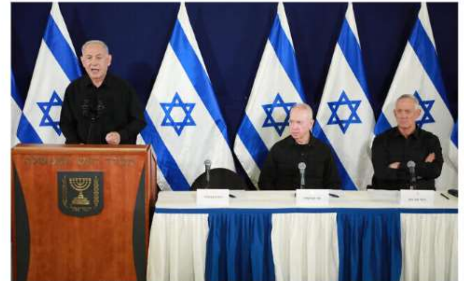
Prime Minister Benjamin Netanyahu speaks (left) as Minister of Defense Yoav Gallant (center) and head of the National Unity party Benny Gantz (right) during a joint press conference at the Ministry of Defense, in Tel Aviv, October 28, 2023.

https://www.timesofisrael.com/pm-never-again-is-now-its-our-2nd-independence-war-humanitys-war-against-evil/