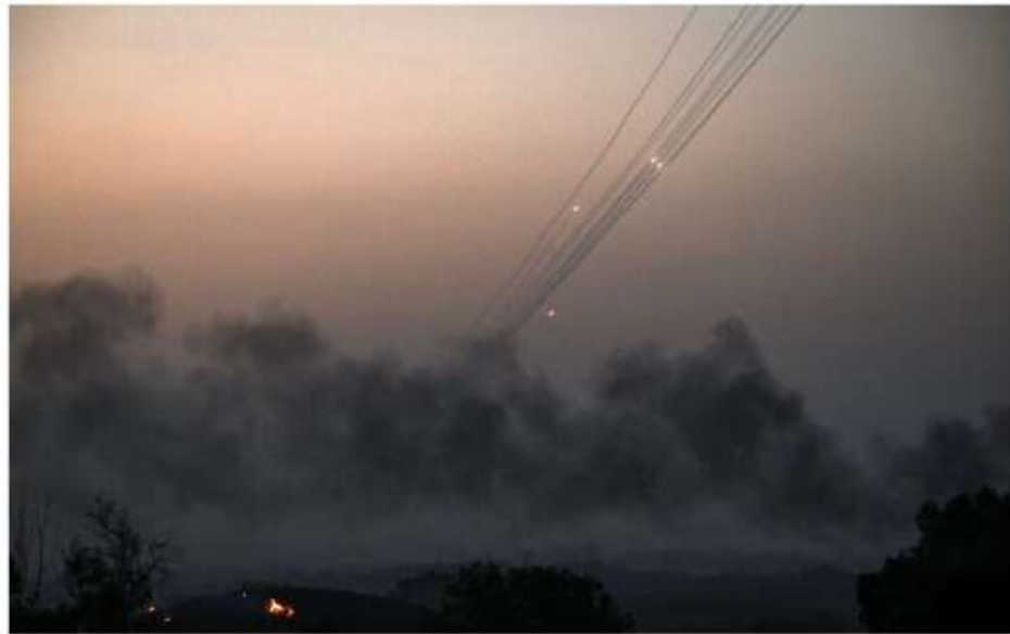
A picture taken from Israel's southern city of Sderot shows rockets fired from Gaza toward Israel as smoke rises from Israeli strikes on October 28, 2023