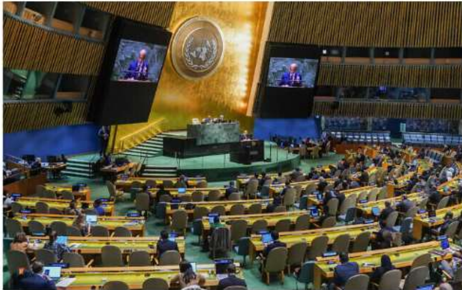
Egypt's United Nations Ambassador Osama Abdel Khalek address the United Nations General Assembly on Friday, Oct. 27, 2023 at UN headquarters.

https://www.timesofisrael.com/un-resolution-urging-immediate-gaza-ceasefire-passes-with-overwhelming-majority/