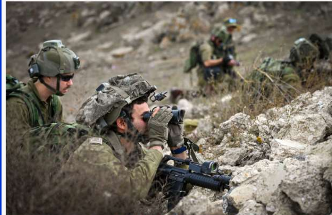
Israeli reserve soldiers seen during a military training in the Golan Heights, northern Israel, on October 27, 2023

Israel struck terror targets in Lebanon amid a Hezbollah rocket barrage on northern communities on Saturday. The widespread attacks in the North came after several days of relative quiet, and included rockets on Margaliot, Misgav Am, and the Bedouin town of Arab el-Aramsha. Three launches from Lebanon towards Israel were detected that fell in open areas. Following the October 7 massacre by Hamas, Hezbollah increased its attacks on northern Israel. More than 40 communities and the city of Kiryat Shmona have been evacuated. On Friday, Hezbollah terrorists attempted to launch rockets toward Israeli territory, the IDF said. “The rockets fell in Syria. Overnight, in response, an IDF fighter jet struck Hezbollah’s military infrastructure in Lebanon.” In response to the launches on the last day, the IDF attacked military targets of the terrorist organization Hezbollah in Lebanese territory on Saturday night.