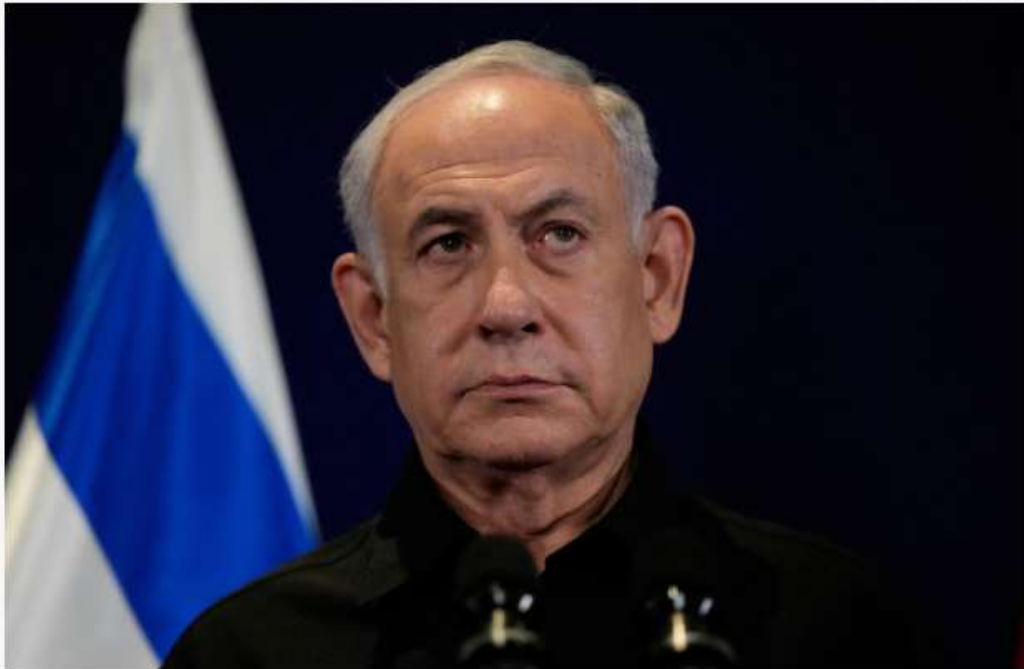
Prime Minister Benjamin Netanyahu speaks to the media during a joint press conference with German Chancellor Olaf Scholz, in Tel Aviv, Israel, Tuesday, Oct. 17, 2023