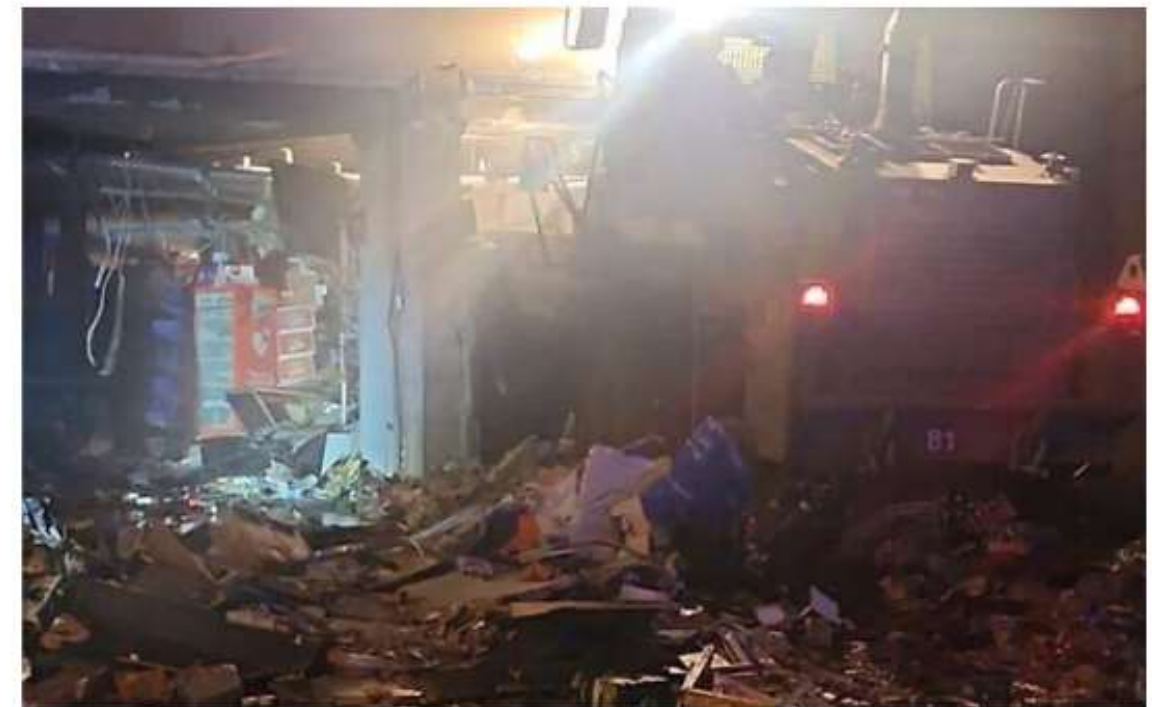
The IDF demolishes a pizzeria in Huwara that posted an ad mocking an elderly woman taken hostage by terrorists into Gaza on October 12, 2023.