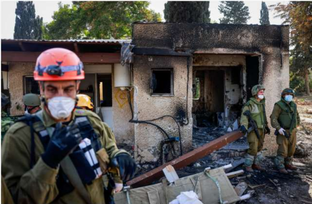
Israeli soldiers around the destruction caused by Hamas Militants in Kibbutz Kfar Aza, near the Israeli-Gaza border, in southern Israel, October 10, 2023.