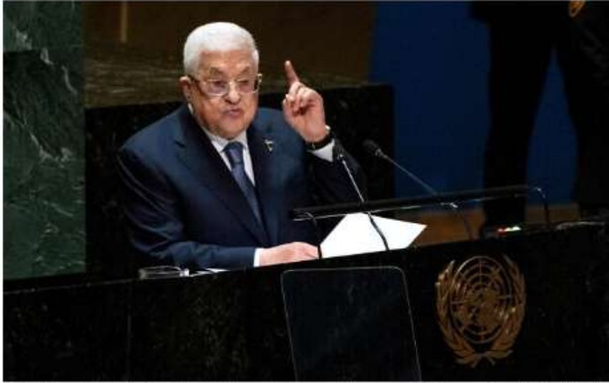
Palestinian Authority President Mahmoud Abbas addresses the 78th session of the United Nations General Assembly, September 21, 2023.

Palestinian Authority President Mahmoud Abbas declares three days of mourning after what he calls a “hospital massacre” in Gaza, a strike that Hamas officials blame on Israel and say killed several hundred people.