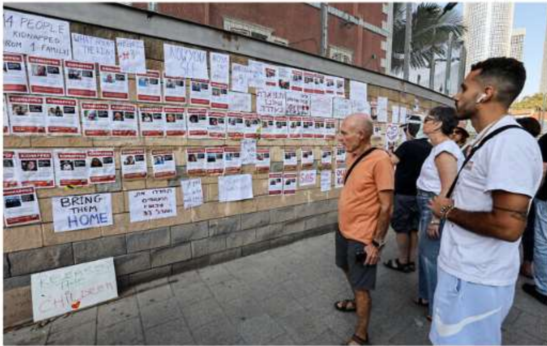
Supporters and family members of Israeli hostages look at images of the hostages plastered on a wall during a rally outside of the Kirya military base in central Tel Aviv on October 14, 2023.

IDF spokesman Rear Adm. Daniel Hagari said the military has some information on the whereabouts of hostages being held in Gaza.