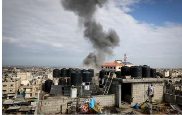
Smoke rises after Israeli air strikes in Rafah, in the southern Gaza Strip, October 17, 2023.

Egypt says Israel is responsible for striking Ahli Baptist Hospital in Gaza City, which reportedly killed hundreds of Palestinian civilians.