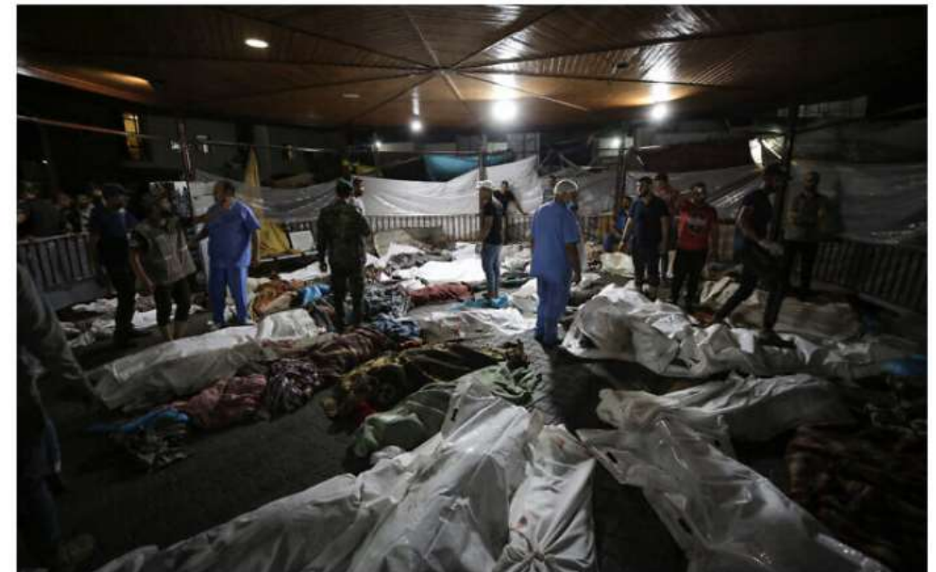
Bodies of Palestinians killed by an explosion near the Ahli Arab hospital are gathered in the front yard of the al-Shifa hospital, in Gaza City, central Gaza Strip, October 17, 2023. Israel said the explosion was caused by a rocket misfire by Palestinian terrorists, denying Hamas claims of an Israeli airstrike.

https://www.timesofisrael.com/israel-says-islamic-jihad-rocket-misfire-caused-gaza-hospital-blast/