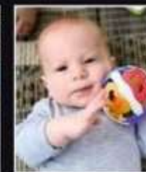
Kafir Bibs 6 months old