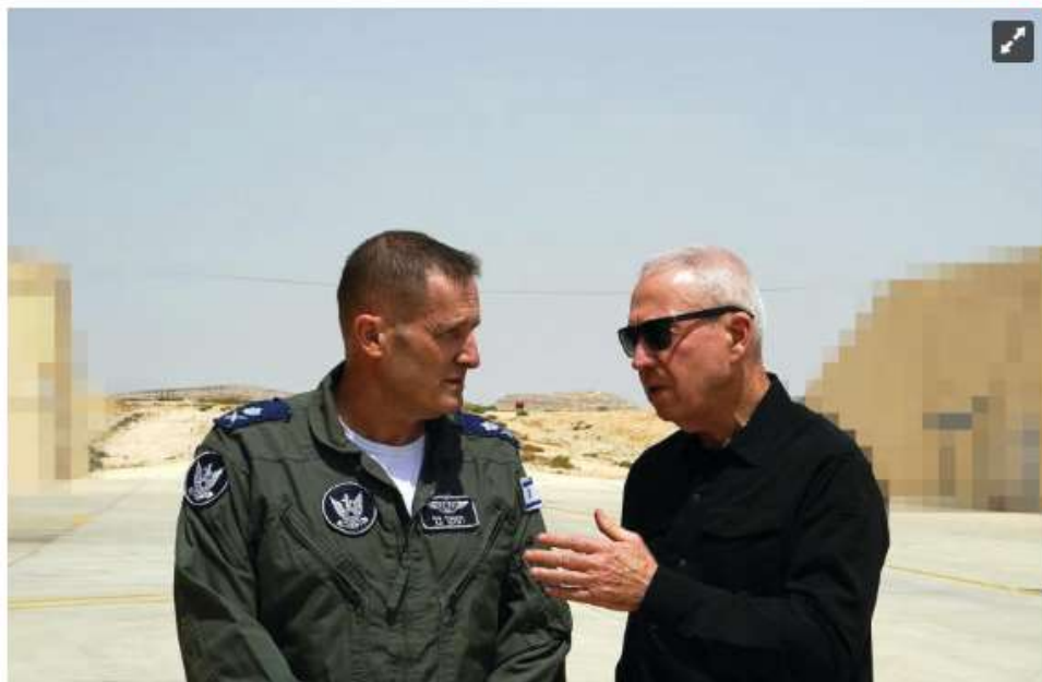
Yoav Gallant with IAF chief Maj.-Gen. Tomer Bar.

The air force chief said he “wouldn’t want to swap places with our enemy and face an IDF division or brigade,” as the army continued with its plans for an invasion of Gaza.