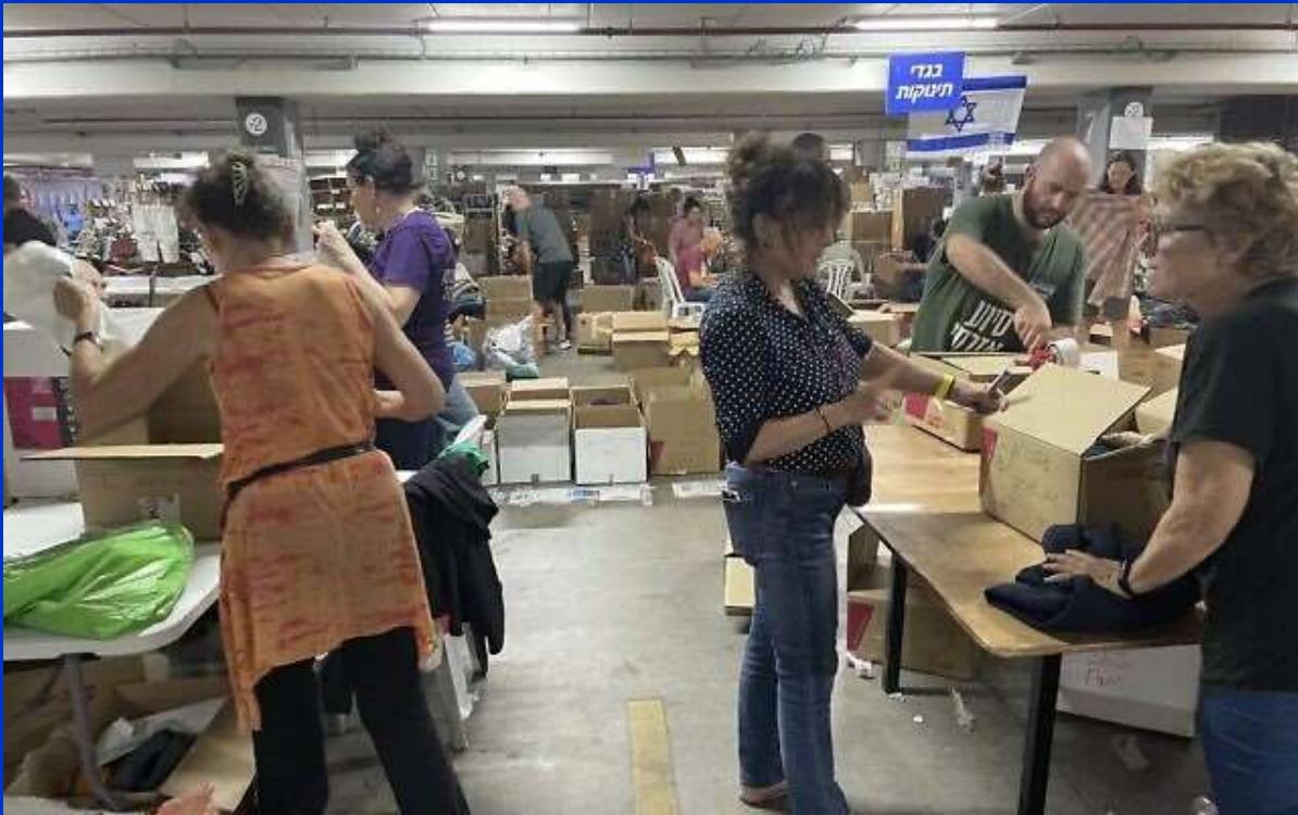
Volunteers help sort and pack donated items at the Civilian Operations Hub, Expo Tel Aviv, October 19, 2023.