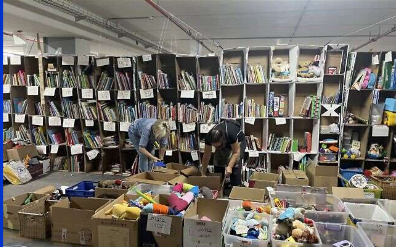
Sorting children's books and toys donated for families evacuated from the southern and northern borders, at the Civilian Operations Hub, Expo Tel Aviv, October 19, 2023.