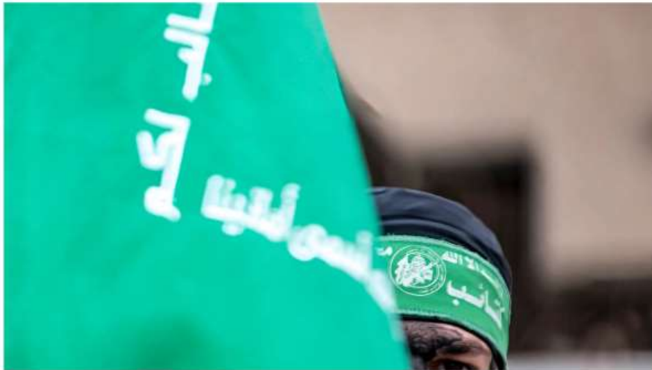
An armed member of the Izz al-Din al-Qassam Brigades.

The Israeli military found a USB key with instructions for the production of a "cyanide dispersion device" on the body of a Hamas operative who participated in the Oct. 7 terrorist attack , according to two Israeli officials and a copy of a classified Israeli Foreign Ministry cable obtained by Axios.