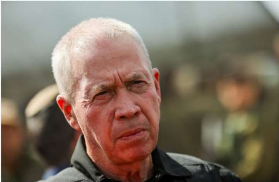
Defense Minister Yoav Gallant speaks with Israeli soldiers at a staging area not far from the Israeli-Gaza border, October 19, 2023.

Defense Minister Yoav Gallant visited Israel's South on Thursday and met with soldiers serving on the Gaza border. "We are first and foremost focused on... defeating Hamas," Gallant said. "I have been leading soldiers into battles for 45 years. I am responsible for security. I was responsible for it these last two weeks - even during difficult times, I am responsible for bringing [Israel] to victory." He later told troops on the Gaza border: "You see Gaza now from afar. Soon, you'll see it from inside." Gallant further noted that the IDF was gearing up for a long-term engagement with Israel's enemies, saying: "We are not talking about a short [military] campaign – we are talking about a prolonged campaign." He then touched on the threat of Hezbollah on the Lebanon border. "Hezbollah is trying to challenge the State of Israel and the IDF, and have deployed [forces] in strong defensive formations. The strength of the entire IDF...is at our disposal. We are alert, and if Hezbollah wants to start a war, it should first look at the photographs of Gaza City."