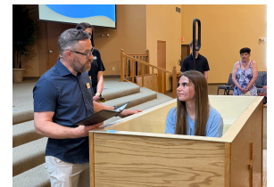
June 7, 2026 Baptism Service