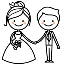
Kallie & Josiah

Let's celebrate their upcoming marriage!