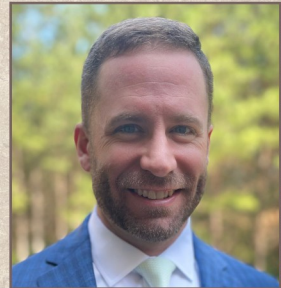
Senior Minister Wayside Presbyterian Church (PCA) Signal Mountain, Tennessee