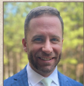
Senior Minister Wayside Presbyterian Church (PCA) Signal Mountain, Tennessee