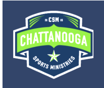
Chattanooga Sports Ministries