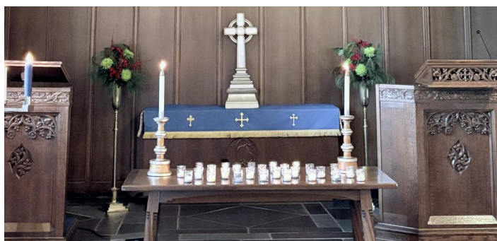
Sunday Evening Worship