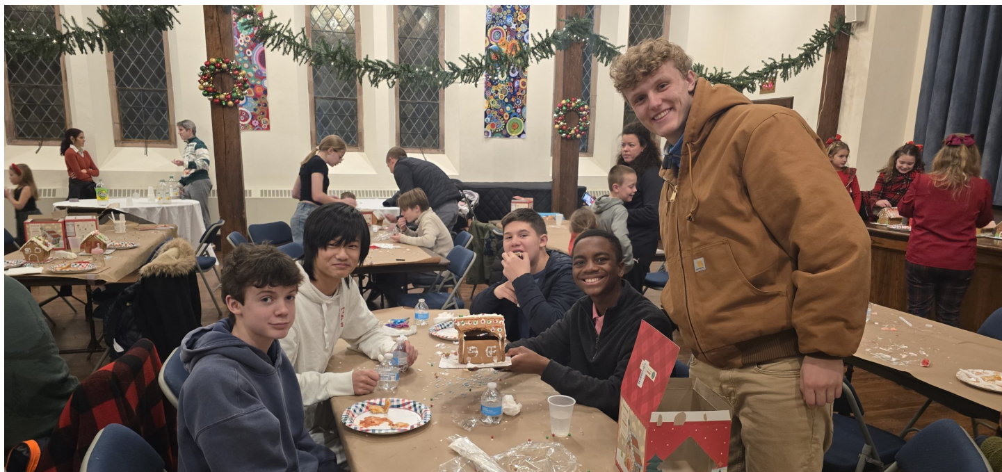
Gingerbread House Decorating Party