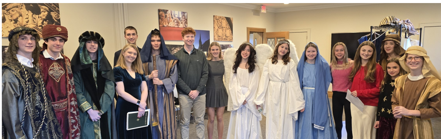
The Live Nativity Cast