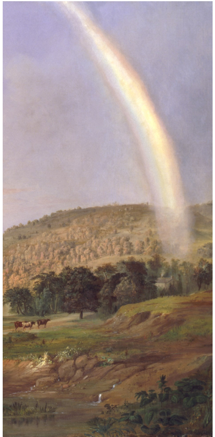
Landscape with Rainbow by Robert S. Duncanson