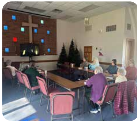
Bible study group watching a movie