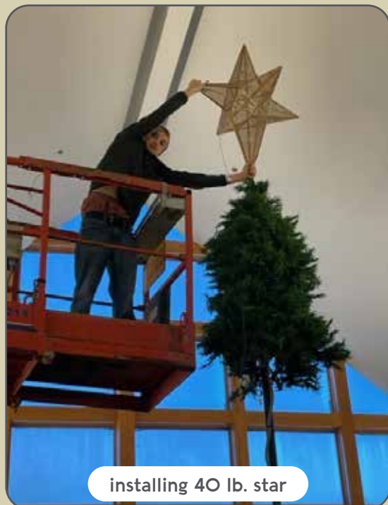
installing 40 lb. star