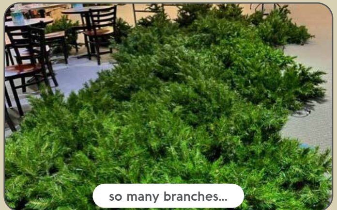
so many branches...