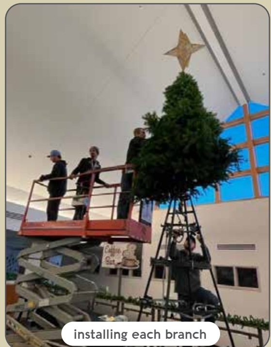
installing each branch