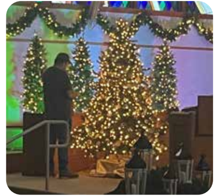
fixing Christmas tree lights