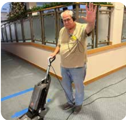
one of the vacuum crew

West Hills is a special place from the parking lot, on the grounds, and inside the building.