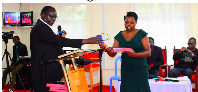
[Teacher receiving gifts]