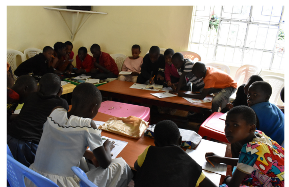
[upper class workshop]