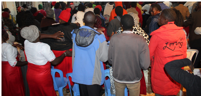
[congregants during a church service]

We invite you to join us for our upcoming services as we continue to seek God's plan for our lives and for our community. Let us come together in unity and in a spirit of expectation, believing that God has great things in store for us. We look forward to seeing you there!