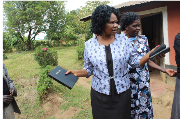
[Bible distribution during evangelism]