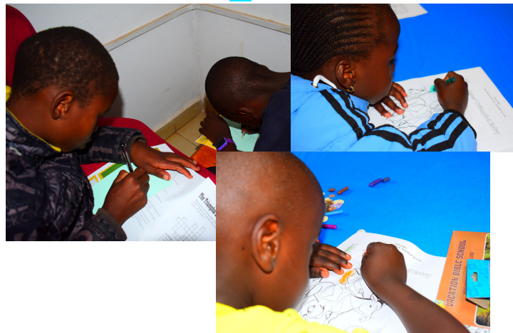
[kids working on the booklets]