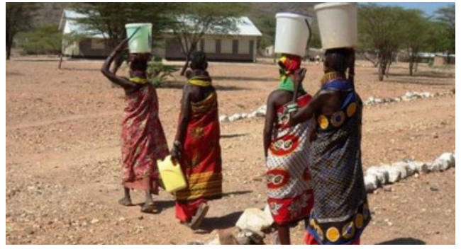
[Turkana women travelling far in search for water]

The team also installed a solar pump and panel kits with a fabricated water tower. Currently, the piping is ongoing, and soon, the water will be available for more than 200 households within the Imani campus.