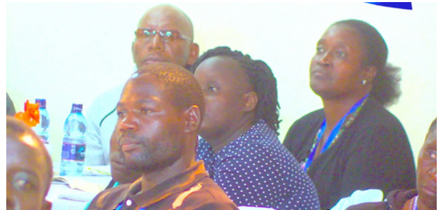
[Yearning for the word of God]