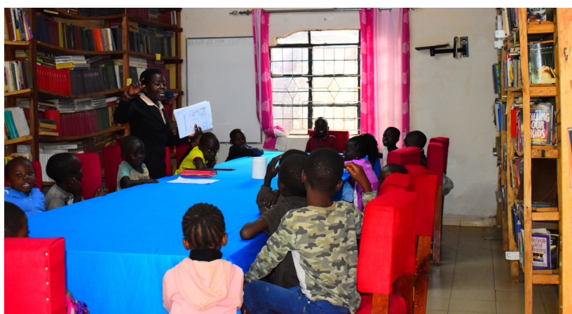
[kids in class]