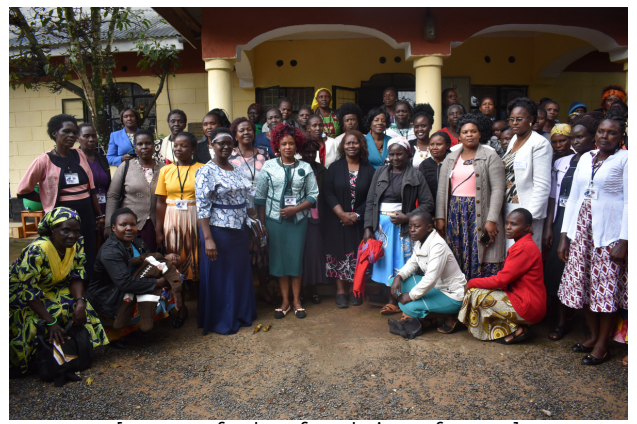
[women of valor after their conference]