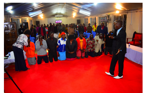
[Intercession for people's needs]