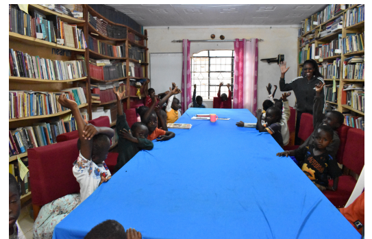
[kids participating in class]