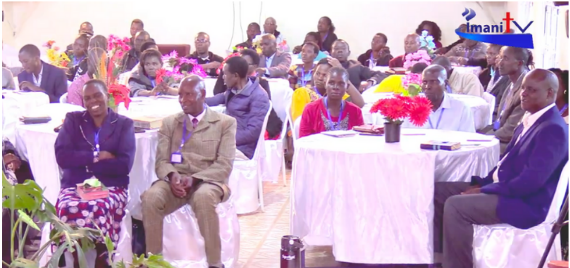
[couples dinner set up]