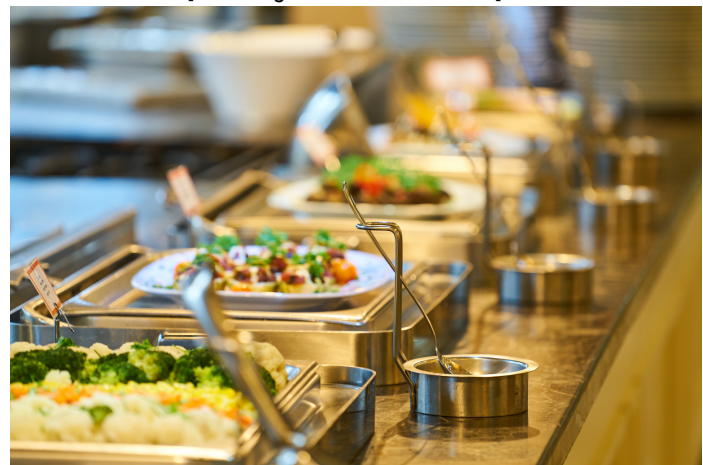
[meals set up]