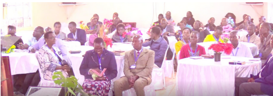
[Couples listening keenly]

The couple also addressed the common challenges faced in marriage, such as communication issues, lack of intimacy, financial struggles, and conflict resolution. They shared practical solutions to these challenges, stressing the importance of open and honest communication, mutual respect, and the willingness to work through problems together.