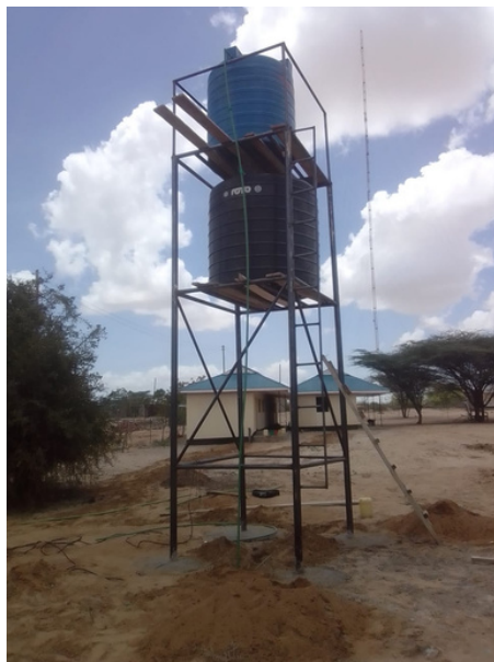
[Installation of water tanks]