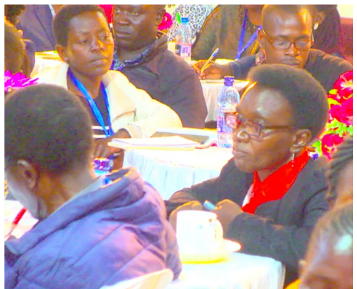
[couples taking notes from the teachings]