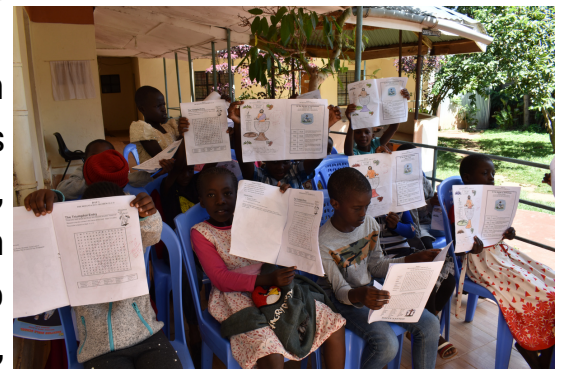
[kids showing off their work]