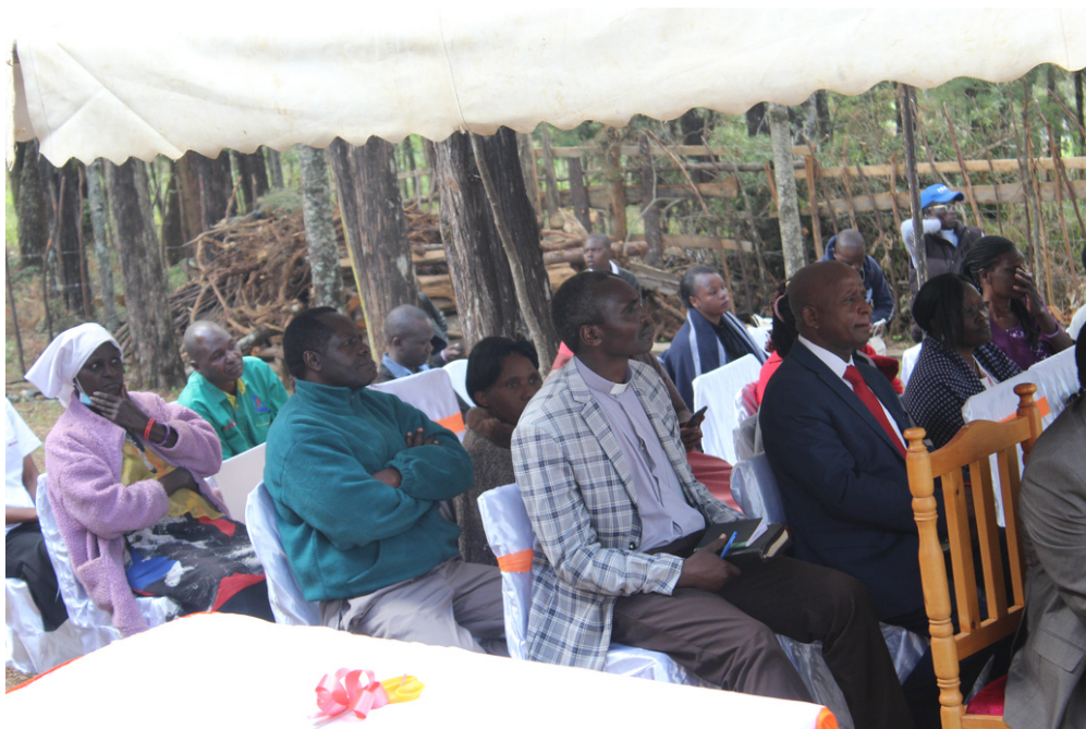
[Guests listening during the Launch]