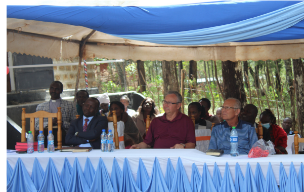
[Guests of Honor during the launch]