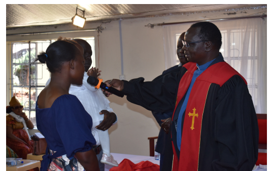
[Rev. Ptallah dedication children before the Lord]