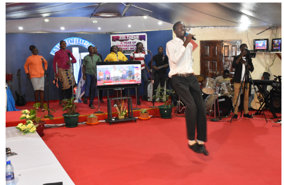
[FIC & Staff team jumping in praise]