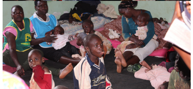
[vulnerable kids receiving help]