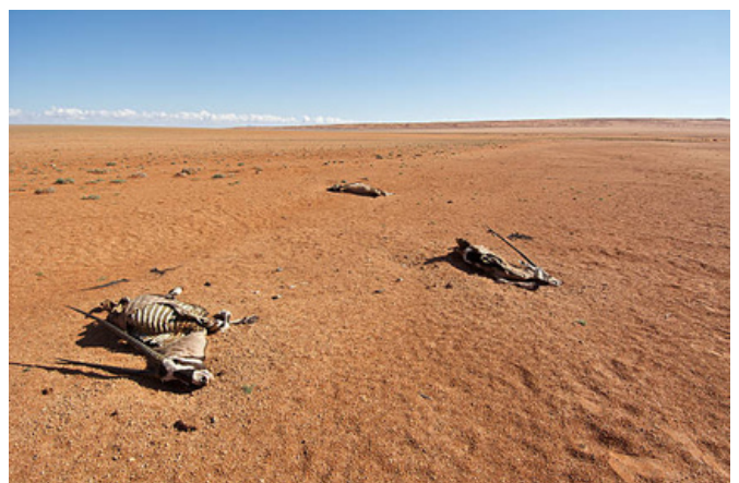
[Dying animals due to drought]