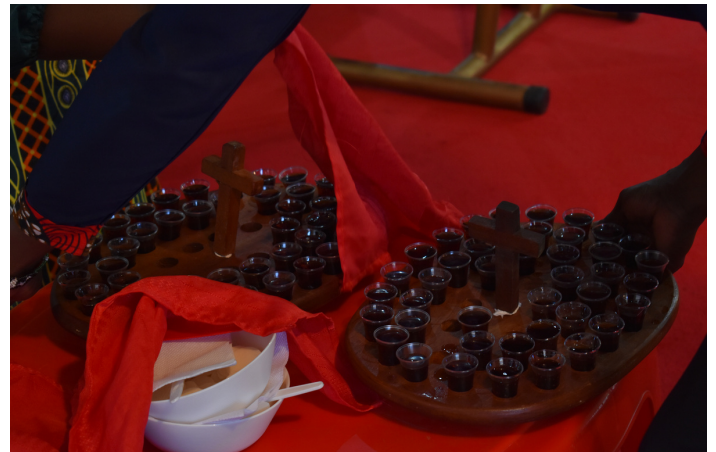
[The Lords table]

On that day when we partook of the bread, we were declaring that Jesus' health and divine life flows in our mortal bodies. And when we partook of the cup, we were declaring that we are forgiven and have been made righteous. Jesus' blood gives us right standing before God, and we can go boldly into God's presence (Hebrews 4:16). When we pray, we can be sure that God hears us!