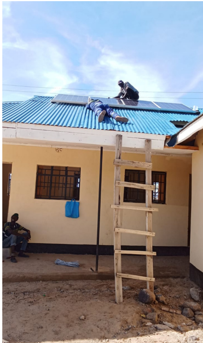
[Installation of the solar panels ]