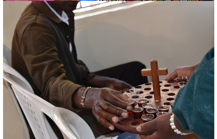
[Congregants taking part in the Lords table]