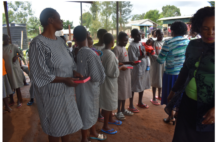
[Prisoners receiving bibles after visitation]