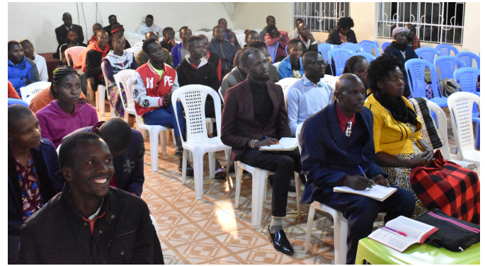
[Members receiving word joyfully]

The night vigil was a truly transformative experience for all who attended. It was a powerful reminder of the importance of seeking God's presence in our lives and relying on His strength and guidance.