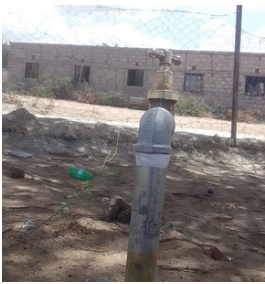
[Water tap installed]