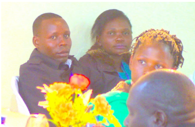
[guests paying rapt attention]