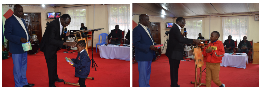
[Top students receiving gifts]