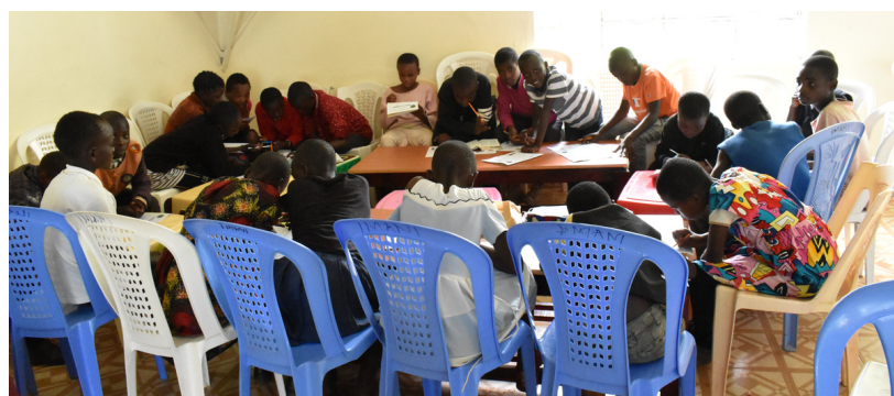
[Kids working on their projects]