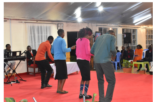
[Dancing for God]