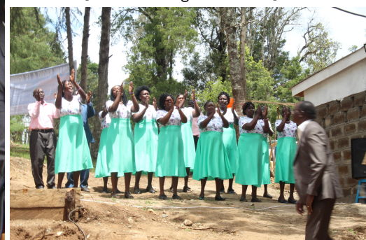
[Choir Presentation during launch]