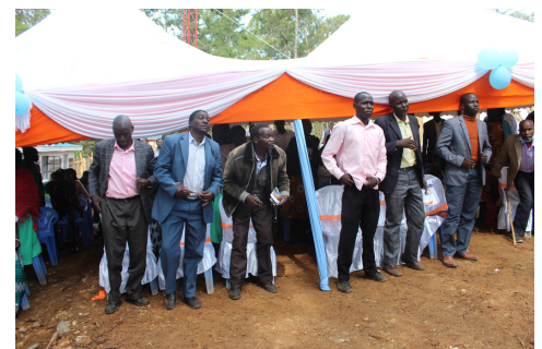
[Guests during the Launch]