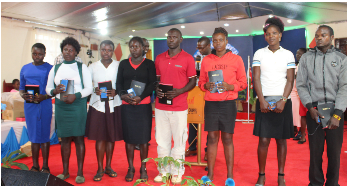
[Youths gifted bibles after the youth rally]