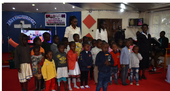
[Kids presentation ]