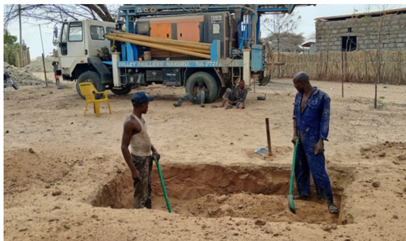
[Borehole drilling in turkana campus]