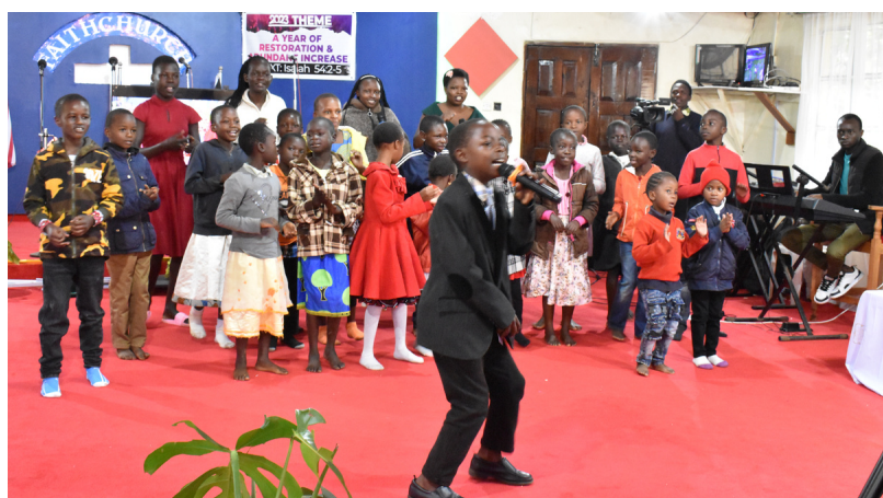
[kids leading songs in church service]