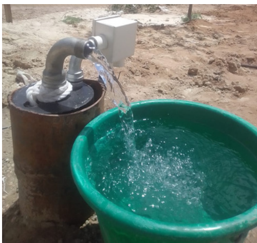
[clean water coming from the well]