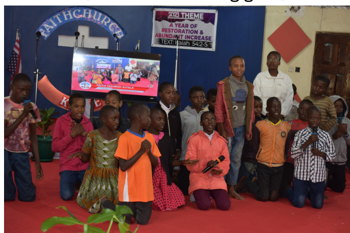
[Kids presentation ]