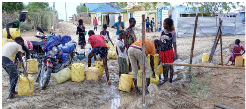
[community enjoying fresh water from the well]