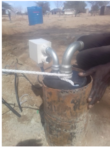
[Water Pump installed]