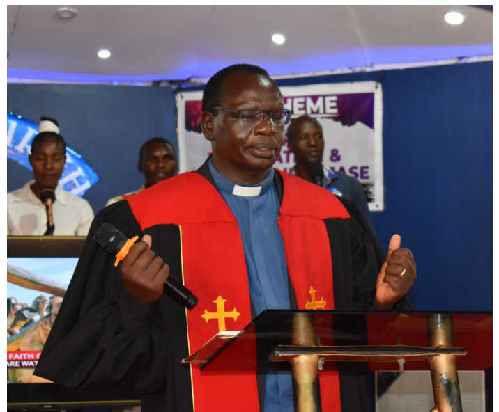
[Rev.Ptallah praying for the Lords table]