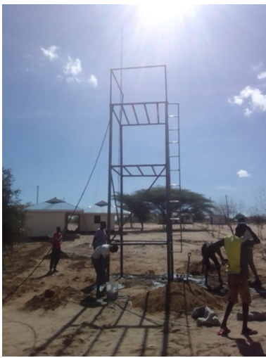
[water tower being fabricated and installed]