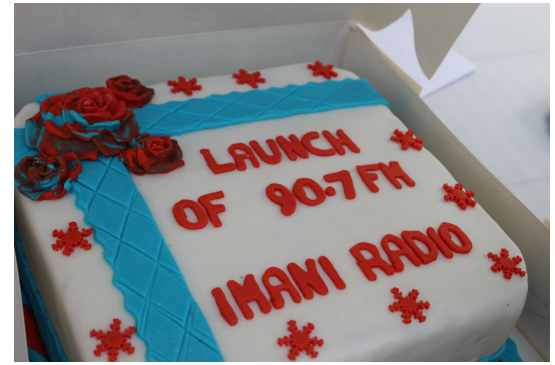
[Baringo's Official Launch]

Despite the many challenges faced by the people of Baringo County, Imani Radio & TV Ministries has been a beacon of hope and a source of inspiration to many. Through its various programs and initiatives, the radio station has helped to improve the lives of many people in many areas, and it continues to make a positive impact in communities.