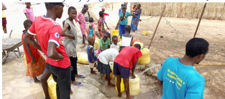
[Community drawing water during pump testing]