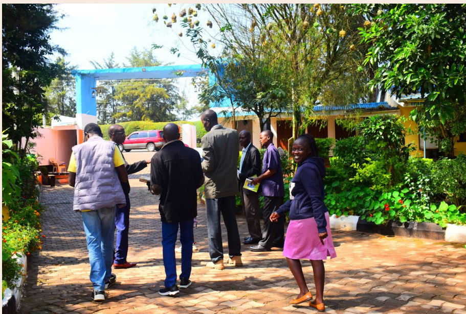
[missioners joyfully leaving for the missions]