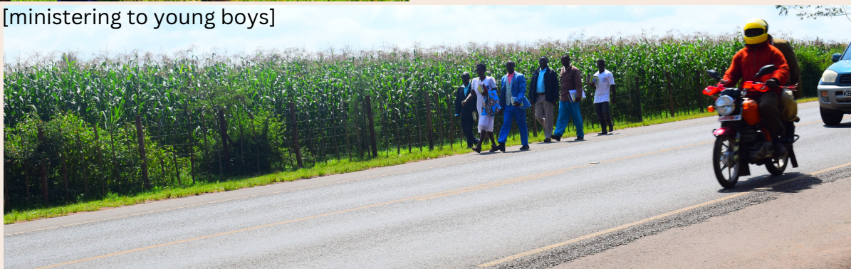
Missionaries doing the walk