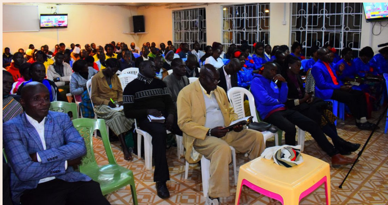
[congregants listening to the word]

During the testimony session, members of the congregation shared their experiences of God's faithfulness in their lives. One notable testimony came from a member who spoke about their decision to give generously to God and His ministry. This act of faith inspired over 30 people in attendance to pledge towards supporting the ministry. The spirit of giving and gratitude permeated the atmosphere, highlighting the impact of faithfulness and obedience.