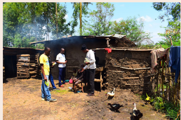
[ministering in a homestead]