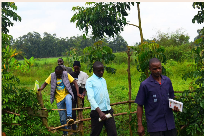
[missioners walking back after successful mission]