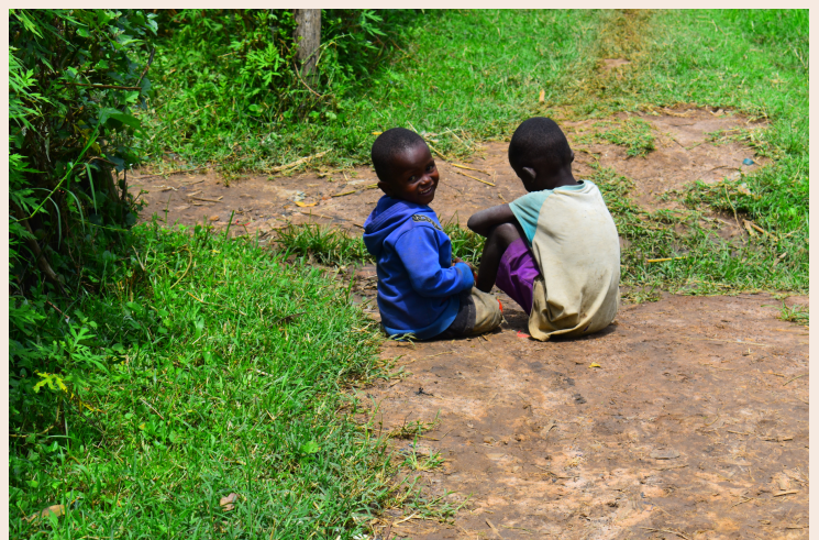
[ministering to children]