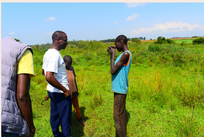
[ministering to young boys]