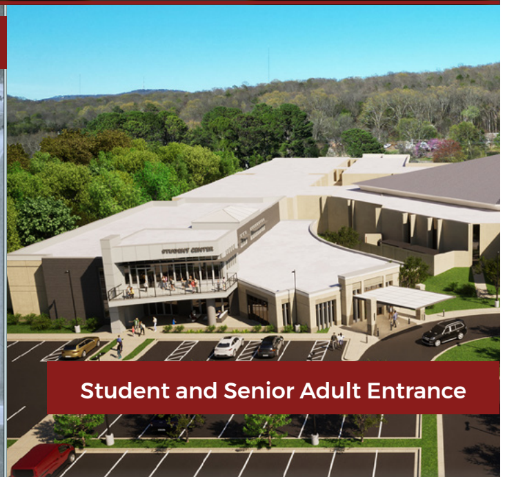
Student and Senior Adult Entrance