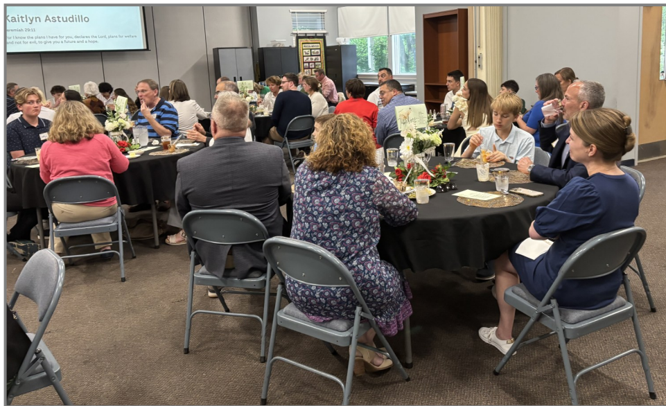
The Confirmands and their families enjoyed an evening together at the Confirmation Banquet held on Wednesday, April 29, 2026 in the Fellowship Hall.