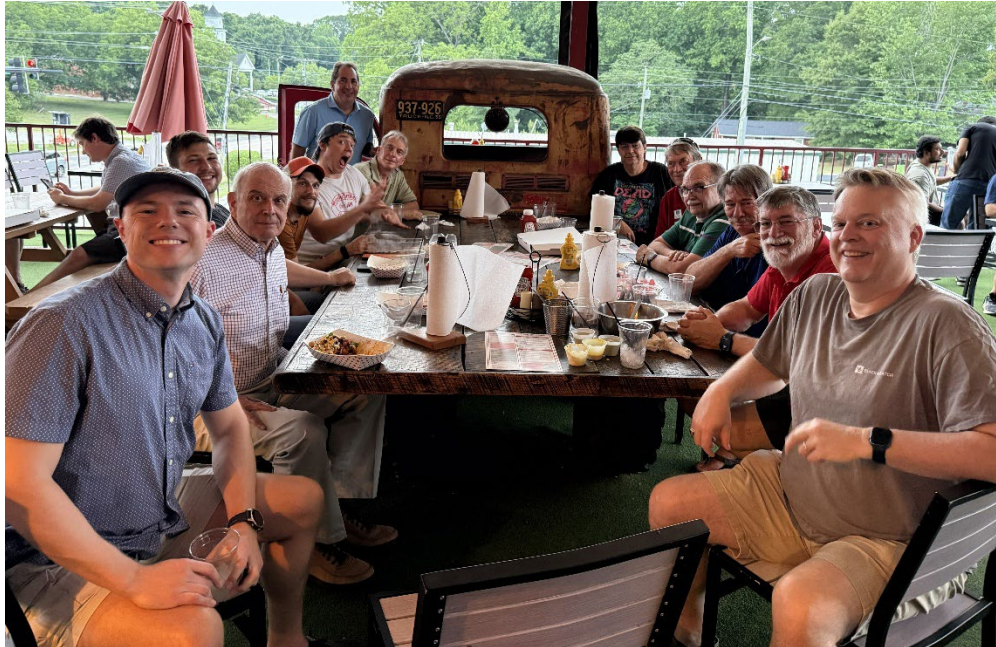
Fun time on June 9th at the Tap Station!

Mark your calendar for our next event on Wednesday, July 22! Join us at Aviator Brewery (688 Brewery Drive) in Fuquay Varina starting at 6:30 pm.