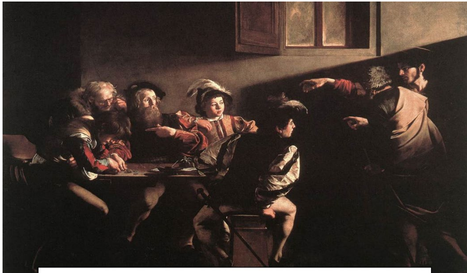
The Calling of St. Matthew, Caravaggio (1599-1600)