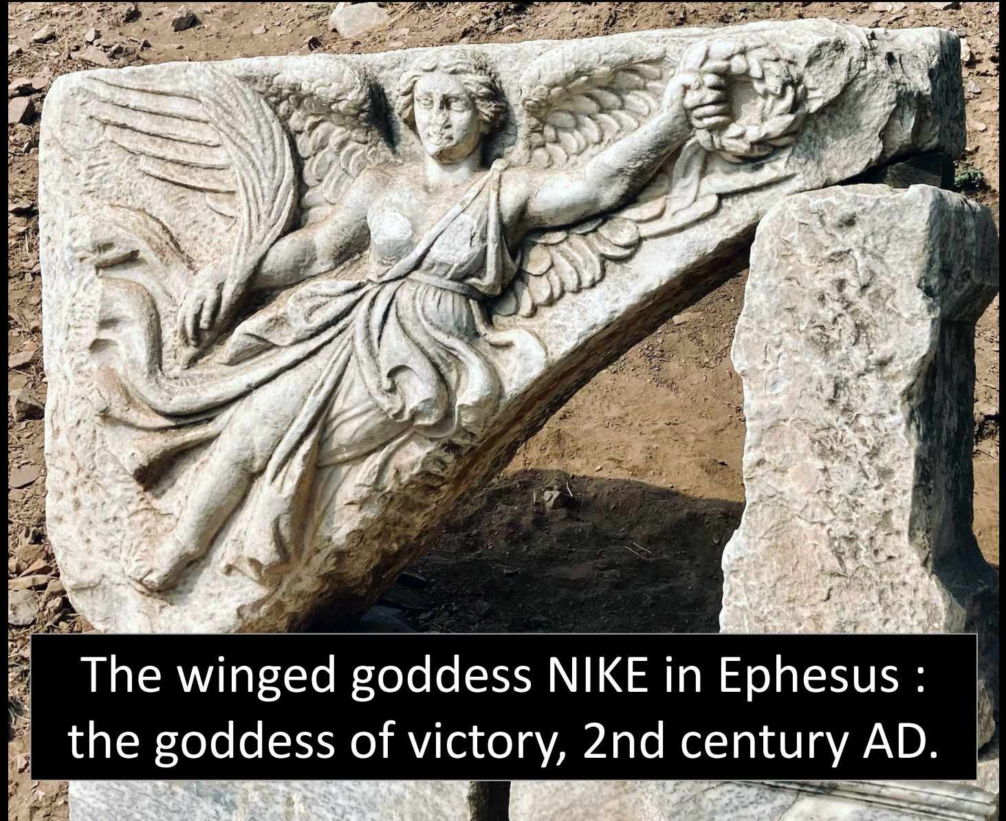
The winged goddess NIKE in Ephesus : the goddess of victory, 2nd century AD.